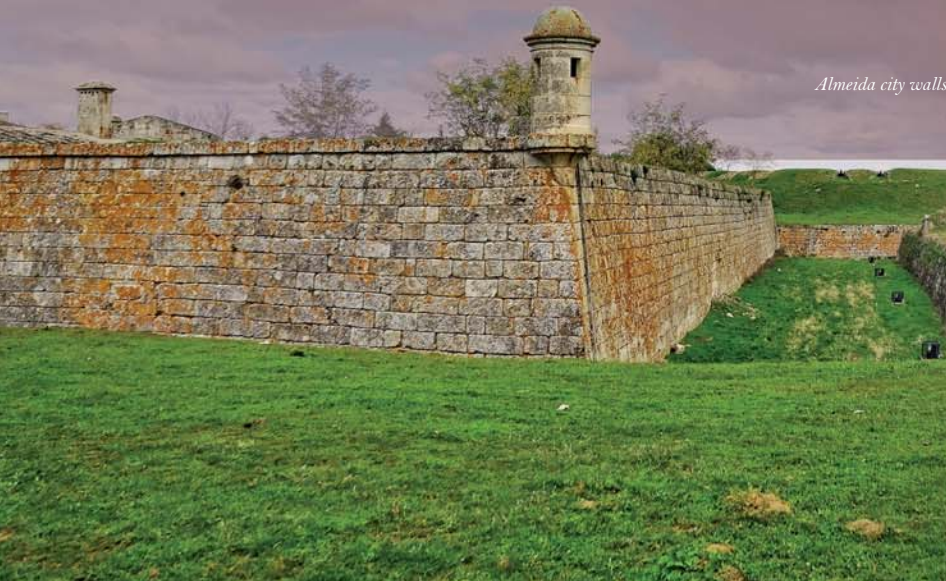
Almeida city walls.