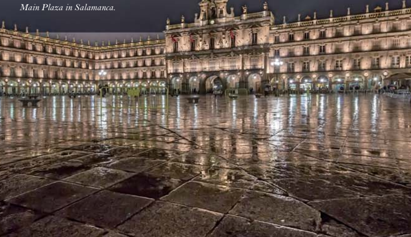
Main Plaza in Salamanca.

A wide range of activities to follow in the footsteps of one of Britain's greatest ever generals and one of the main figures in the Peninsular War.