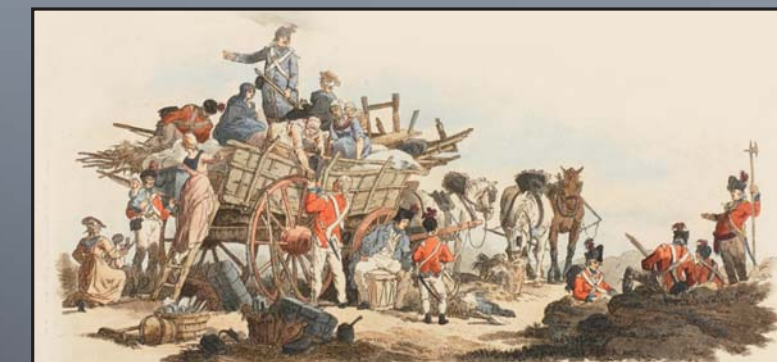
British army baggage train.

The name of Lord Wellington is most commonly associated with the Battle of Waterloo, where Napoleon Bonaparte was defeated for the final time. However, the brilliant British general had previously won fame throughout Europe for his exploits against French troops in Spain and Portugal, where he won stunning victories in numerous battles and sieges.