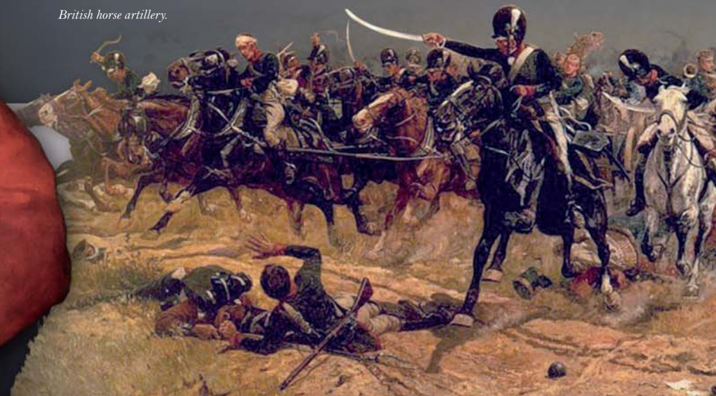
British horse artillery.

Patient and meticulous, his successes were a result of both his military prowess and his logistical expertise, his elaborate network of spies, and his firm network of diplomatic contacts, which ensured the support of the Government in London and granted him broad control of all the British and Portuguese forces in the Iberian Peninsula. His strategy of waiting and harassing enemy forces in more difficult times alongside powerful offensives at the right time were one of the deciding factors in the allied victory in the Peninsular War.