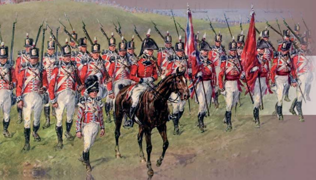
Line of British infantry.

In 1812, he went on the offensive, taking Ciudad Rodrigo and prevailing at the Battle of Salamanca, before having to return to the border for the winter. However, French power in the region was now severely weakened. In 1813 Wellington was able to take what is now Castilla y León with almost no fighting, forcing King Joseph to leave the Iberian Peninsula shortly afterwards.