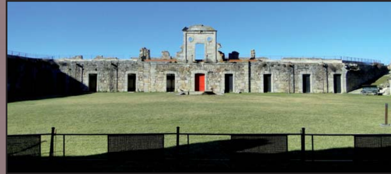
Fortress of the Conception in Aldea del Obispo.

Given his achievements, Wellington was granted control of the Spanish, Portuguese, and British armies, despite the differing objectives of the allies, which unified the war effort in the final stages. Such a display of confidence makes him the clear main attraction in the Wellington Trail , which journeys between the places where the Duke left his mark, such as barracks, churches, cities, towns, fortresses, and, of course, the battlefields where we can now find cultural resources giving us an insight into the war years.