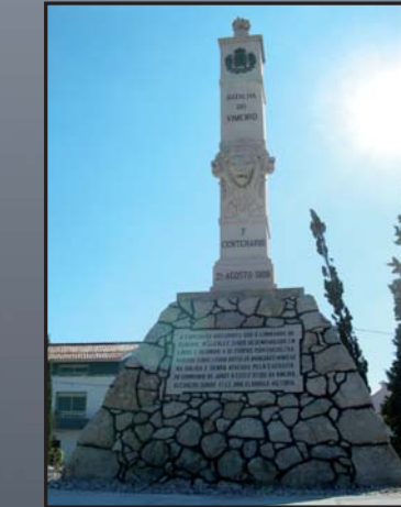
Monument commemorating the Battle of Vimeiro.

Salamanca, Mortágua, Vimeiro, Ciudad Rodrigo, Valladolid, and Bus-saco house interpretation centres, permanent exhibitions, and military museums covering his operations; Alba de Tormes, San Felices de los Gallegos, Torres Vedras, and Alqueidão retain fortified positions where French and allied troops left their mark; Primer Edecán conduct guided tours of the battlefields. What's more, we can stay in unique buildings such as the Parador hotel in Ciudad Rodrigo or the Palace Hotel in Bus-saco and take in the Archaeological Site in Siega Verde or the Toro Wine Route.