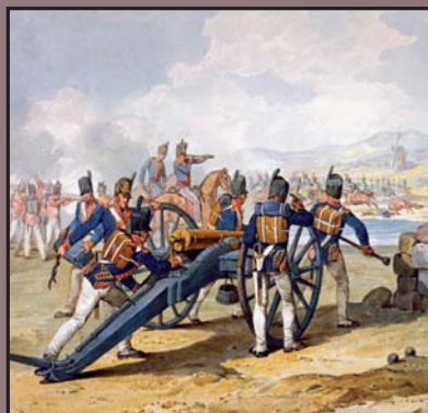
British field artillery.

Faced with the enormous imperial army that invaded Portugal for the third time in 1810, Wellington adopted a defensive approach. He won at Bussaco but had to continue to fall back to the Lines of Torres Vedras, a network of carefully fortified positions, which forced the French to withdraw back to Spain in 1811. A final attempt to overcome Wellington failed at Fuentes de Oñoro.