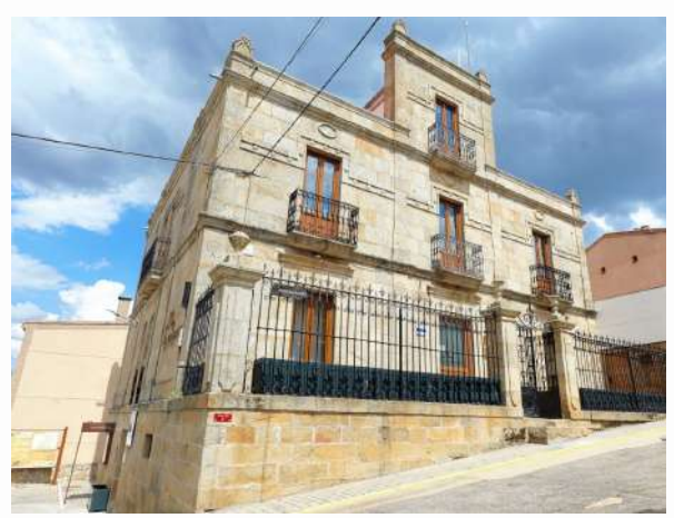
Posada Real Casa Brasilero, Saucelle, Salamanca