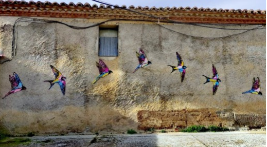
Pinturas en Castrogonzalo, Zamora

Remember, in Castilla y León, you'll find everything and more... WE CAN'T WAIT TO SEE YOU!!!