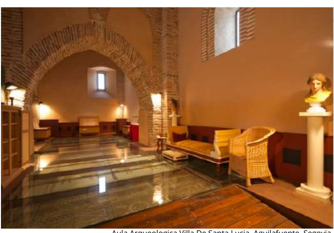
Aula Arqueologica Villa De Santa Lucia, Aguilafuente, Segovia

Another important event in this town is its celebration of the "Sinodal de Aguilafuente", the first book printed in Spain, which takes places in August. There is also a museum dedicated to the sculptor Florentino Trapero, winner of first prize at the National Exhibition of Polychrome Sculpture in 1922.