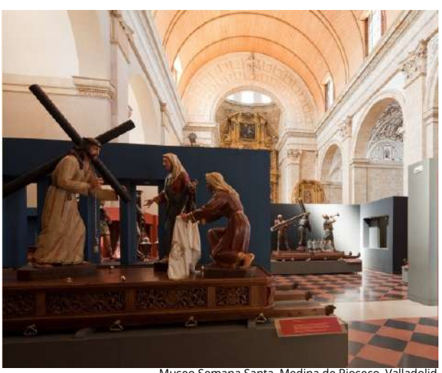
Museo Semana Santa, Medina de Rioseco, Vallado