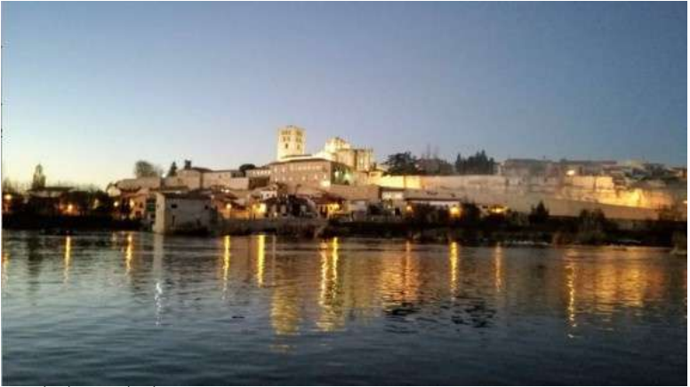
Vista desde Los Pelambres, Zamora