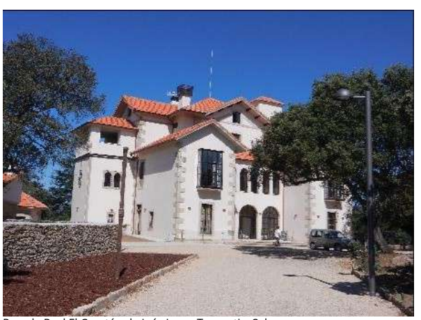
Posada Real El Cuartón de Inés Luna, Traguntia, Salamanca