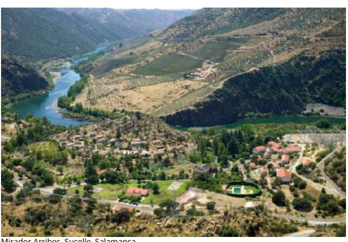
Mirador Arribes, Sucelle, Salamanca