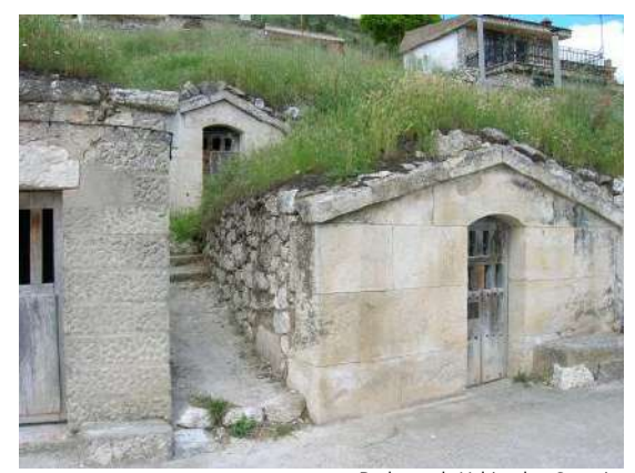
Bodegas de Valtiendas, Segovia

The Valtiendas Denomination of Origin covers the north of the province, in the areas alongside the River Duratón. It includes the municipalities of Valtiendas, Aldeasoña, Calabazas de Fuentidueña, Cuevas de Provanco, Fuentesoto, Fuentidueña, Laguna de Contreras, Sacramenia, and Torreadrada. Grown at an altitude of 900m, tempranillo and albillo are the main varieties used in the red and rosé wines. Whilst these wines may be similar in mountainous terrain, climate, and varieties to the D.O. Ribera de Duero, their unique notes are found in the gravely, pebbly soil and underlying layer of clay that drain rainwater but keep the vines watered. Vineyards in the P.D.O. Vinos de calidad de Valtiendas must also meet certain density and yield requirements (minimum 2000 and maximum 4000 vines per hectare). The whole area is well worth a visit, with places such as Sacramenia and Fuentidueña which have been untouched by time. In Fuentidueña there is the San Miguel Church to explore, the old Hospital de La Magdalena, the ruins of San Miguel and the necropolis, the castle, the town walls, and, of course, the local lechazo asado roast suckling lamb to taste.