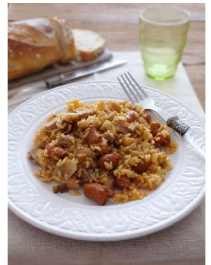
Arroz a la zamorana