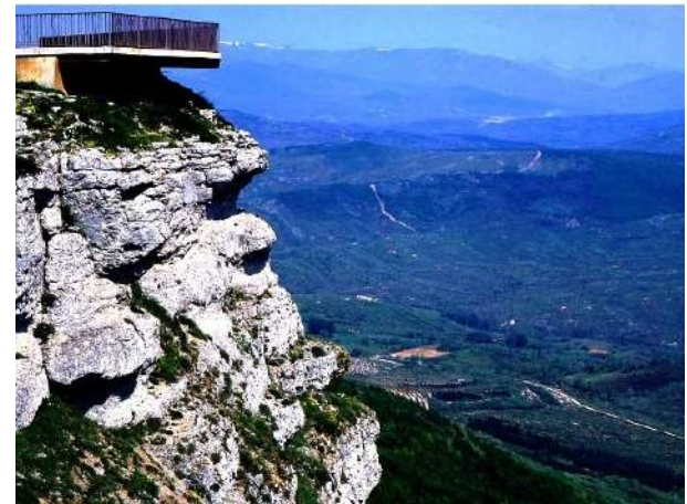
/irador de Valcabado, Palencia

Allow your inner adventurer to explore the underground world and discover the Cueva de los Franceses, in Revilla de Pomar, close to Aguilar de Campo, in the Montaña Palentina and Las Loras UNESCO Global Geopark. This karst cave is almost 500m long. The acoustics and the play of the light add to the beauty of the natural display of stalactites and stalagmites. Extending the cave has opened up two new thousand square metre galleries that reveal more of the cave's secrets. Nearby is the remarkable "Canto Hito", a standing stone over three metres tall set into the moorland, and the "Pozo de Los Lobos" (Wolf Pit), an old trap used to capture wolves. Lastly, there is the Valcabado Viewpoint, 800m from the cave, where you can take in stunning views of the mountains and valleys surrounding this magical place. Make sure to book your visit on 659 949 998