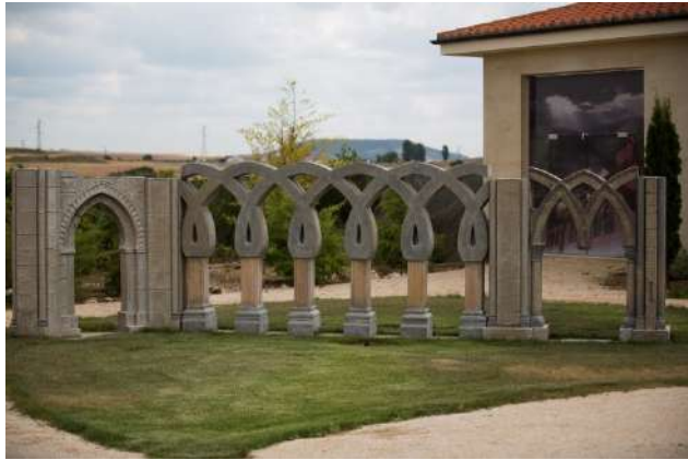
Museo Romanico, San Esteban Gormaz, Soria