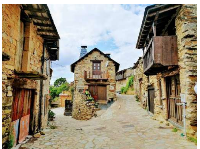
Santa Cruz de los Cuérragos, Zamora