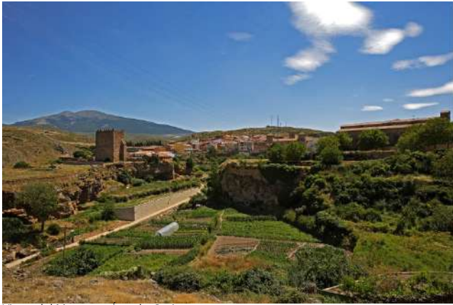
Vistas del Moncayo. Ágreda, Soria