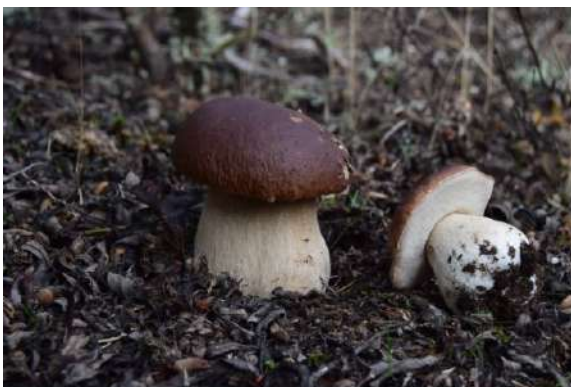
Boletos de Jara, Zamora

In autumn, the forests are full of mushrooms and mushroom lovers flock to the countryside in search of their favourite varieties. Zamora is one of the top 5 destinations for mushroom tourists. The districts of Sanabria, La Carballeda, and Aliste are three of the most typical regions of Zamora province where you can enjoy picking mushrooms, as well as trying out the finest dishes at the mushroom events hosted by restaurants in the province and visiting the Fungi Interpretation Centre in Rabanales. This centre and the Mycology School in Ungilde run countryside trips where you can pick saffron milk caps, boletus, russula, and many other varieties. With over 500 recorded species of mushrooms, Zamora province has one of the highest concentrations of mushroom production in Spain. Visitors can get a two-day recreational pass for €10 which allows them to explore the mushroom-growing areas in the project and collect up to 3kg of mushrooms per day.