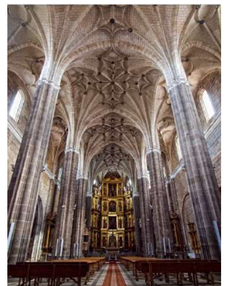
Iglesia de San Sebastian en Villacastín, Segovia