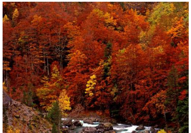
Hayedo Espacio Natural Monte Santiago. Burgos

One of the most mysterious forests, especially beautiful in autumn with an impressive display of thousands of colours visitors can appreciate, are beech forests. In Burgos province they are found in mountainous, rainy areas. Many are also found in protected natural spaces and offer signposted walking trails with different levels of difficulty. One of the most popular is the beech forest in Santa Cruz del Valle Urbión, where the Enrique del Rivero Path leads to a spectacular tree, known as the "most famous beech tree in Burgos". There are other wonderful beech forests in Monte Santiago Natural Monument, the Hayedos del Humión in Montes Obarenes or the Mena Valley, and the beech forests in Leciñana and Haedo Visiting them is a great day out.