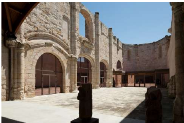
Monasterio San Leonardo, Alba de Tormes, Salamanca