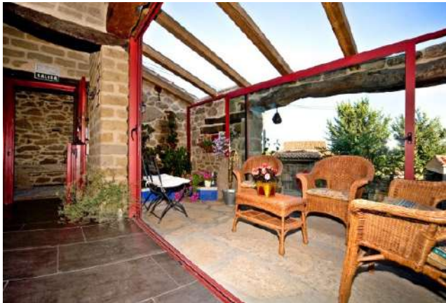
Posada Real La Mula de los Arribes, Villardiegua de la Ribera, Zamora