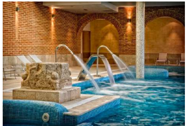
Castilla Termal Balneario de Olmedo, Valladolid

A spa is a site which has medicinal mineral water. The difference in the water is the result of geological origin. Water heated by hot rocks flows at temperatures of up to 50°C whilst groundwater is more filtered and can appear in any location at lower temperatures. Spas are recommended for people experiencing problems related to their skin, circulation, rheumatism, and kidneys, as well as being a lovely place to spend a few days relaxing and resting. Bathing in thermal springs increases body temperature, which kills germs and viruses, increases hydrostatic pressure, which increases blood flow and oxygen supply. This increase in temperature helps dissolve and eliminate toxins in the body.