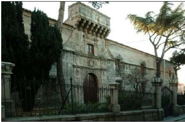
Palacio Polentinos, Ávila