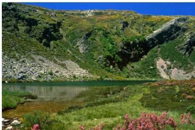
Lago de Truchillas, La Cabrera, León

Cabrera Leonesa is located in the southeast of the province and holds outstanding natural beauty and cultural heritage. Traditional architecture is distinguished by the use of slate sheets, with prominent balconies and external stairways made from large stones. You can find some examples in the town of Villar del Monte, where you can also pay a visit to the Castile and Leon Museum of Lace or explore local traditions in the Cultural Centre. Towns such as Iruela and Forna also offer interesting architectural cases. There is the outstanding Cabrera Museum in Encinedo and the Chocolate Museum in Castrocontrigo. The Romans built a number of canals in Cabrera to supply water to the gold mines, the traces of which can still be seen on the hillsides. You can travel sections of them in Peña Aguda or Saceda. One of the most accessible stretches is near the Virgen del Valle shrine between Llamas de Cabrera and Odollo. Near the village of Corporales is the Corona archaeological site which houses two pre-Roman forts. You can round off your visit by sampling some of the traditional dishes from the region, made with local produce, such as the caldo cabreríés broth of cabbage, beans, and potatoes seasoned with chorizo, ham, and bacon.