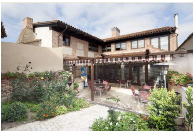
Posada Real Hosteria del Mudejar, Ávila