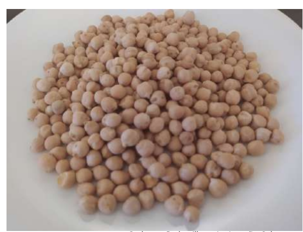
Garbanzo Pedrosillano, La Armuña, Salamanca