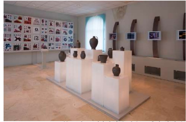
Museo Centro de la Cerámica Quintana Redonda, Soria