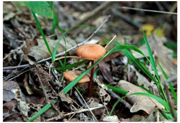
Turismo micológico, Burgos

Mushroom tours and walks are an autumn activity for all ages. Autumn, when the countryside takes on a stunning range of colours, is when there is a greater range and variety of mushrooms to be found. This activity can be enjoyed throughout Burgos province as the diversity of habitats and high rainfall in much of the region make for a great variety in mushroom species. We can find all types of fungi species in forests of Pyrenean oaks, oaks, beeches, pines, and in pastures. The areas of Demanda-San Millán, Valle de Mena, and the district of Pinares are some of the areas regulated by Micocyl, under which the mushrooms from these regulated mountains are labelled with a quality seal from the area. In autumn we can also find mushroom-based menus and events in many of the towns and restaurants and hotels in the region.