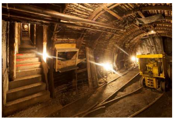
Museo Minero, Barruelo de Santullán, Palencia

Our pets are part of our family life and that's why we like to travel with them, see the world, and enjoy these places with them at our side. Here is our selection of several places in our province you can visit with your dog.