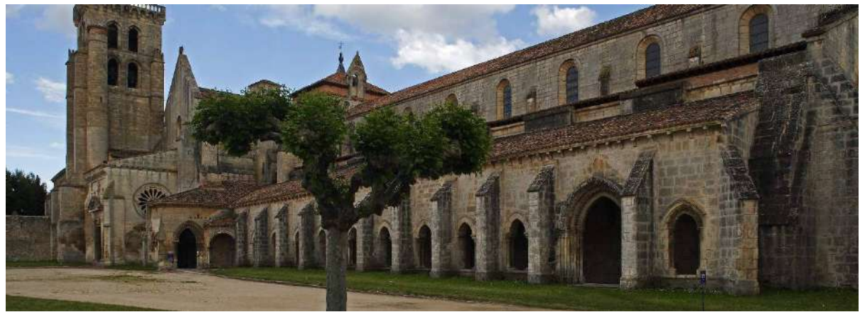
Monasterio Santa María Real de las Huelgas, Burgos