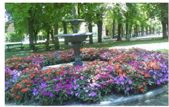
Bosque Mágico Huerta Guadián, Palencia

An exciting adventure designed exclusively for the city of Palencia, and the only one of its kind in Castile and Leon!