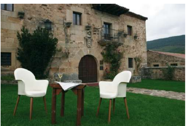
Posada Real de la Mesta, Soria