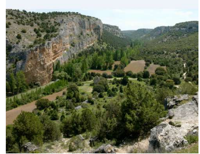
Hoces de Riaza, Segovia

The Hoces del Riaza Natural Park lies in the north-east of the province. The most interesting aspect of this stunning spot, besides the astonishing canyon, is the vast diversity of the birds there, especially birds of prey, including the colony of Griffon vultures, which is one of the biggest in Europe. There are many ways to explore this area but we would suggest three main areas. Firstly, the path between Maderuelo and the Linares del Arroya dam which is a relatively smooth climb. Secondly, the stretch between the dam and the stream at El Casuar where the river forms a canyon in the limestone that is 150 metres deep and around 250 metres wide. And, lastly, the fertile valley, nestled between the river and Montejo de la Vega de la Serrezuela. Yet, as well as savin junipers, holm oaks, gall oak groves, shrubland, the fauna including mostly birds such as the Griffon vulture, the Egyptian vulture, the common kestrel, the bird population of ducks, grey herons, and the limestone geological features, we also have cultural heritage nearby in El Casuar shrine, the remains of the church in Linares del Arroyoa, and villages full of monuments, such as Maderuelo, which is listed as a Historic Site.