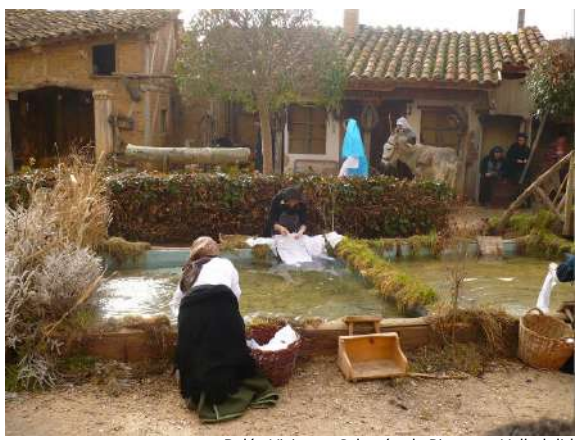
Belén Viviente, Cabezón de Pisuerga, Valladolid

In the Christmas season, the province of Valladolid transforms into the ideal setting for living nativity scenes. There are various towns we can visit to see these wonderful spectacles. It is the residents of these towns and cultural association who give up their own time to work on this delightful folk custom, as the tradition is very deep-rooted in the region. Most of them are on a stage but they all share the same idea, one way or another, of depicting the birth of Christ, and other biblical events such as the Annunciation, Mary and Joseph reaching Bethlehem, and the Adoration of the Three Kings. We must make special mention of the people in our region, where great importance is given to traditional Castilian crafts. Their popularity and prevalence have grown significantly in recent years, as they hold an important place in tradition and, above all, because of their religious symbology. They are not only a delight for adults, children also love them, as it is one of the best ways for them to understand the meaning of the holidays since the best way to learn is by experiencing it for themselves.