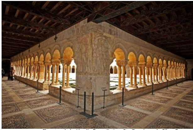
Claustro de la Abadia Benedictina. Sto Domingo de Silos, Burgos

On the last Saturday of January, the Fiesta de los Jefes (The Boss' Celebration) is held in the beautiful town of Santo Domingo de Silos, which has been declared a regional tourist attraction. It is one of the most unique winter festivals in our province that has its roots in the Muslim invasion of the Peninsula, when legend has it that a Moorish army besieged the town, and the people of Silos pretended there was a fire so that the enemy would think it was pointless to continue with the siege. The complexity of the festival and its ethnographic variety constitute a ritual that blends various traditions and origins, some historical, others imagined, all of which possess an anthropological double meaning that is as exciting as it is intricate, making this celebration one of the most notable in the Burgos area.