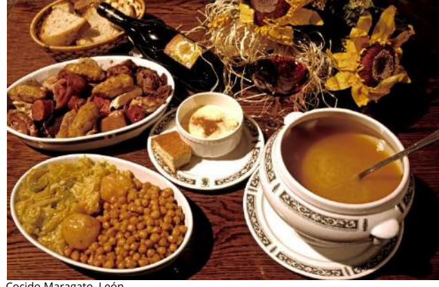
Cocido Maragato, León