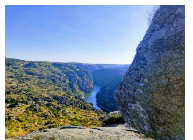
Mirador de Peña Redonda. Villardiegua de la Ribera, Zamora