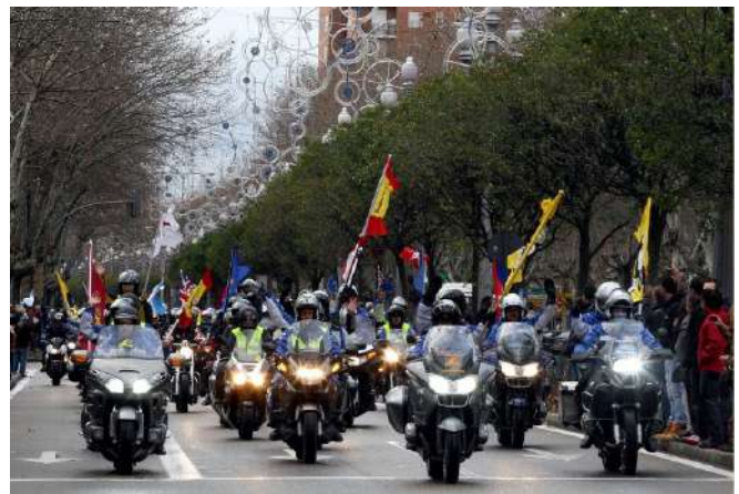
Los Pingüinos, Valladolid

of flags in the centre of Valladolid, and the New Year's Eve and Penguin New Year's party, where pine nuts are eaten at every stroke of the midnight bells instead of the traditional grapes. Whether you are a motorcycle fan or not, this is a must-see event.