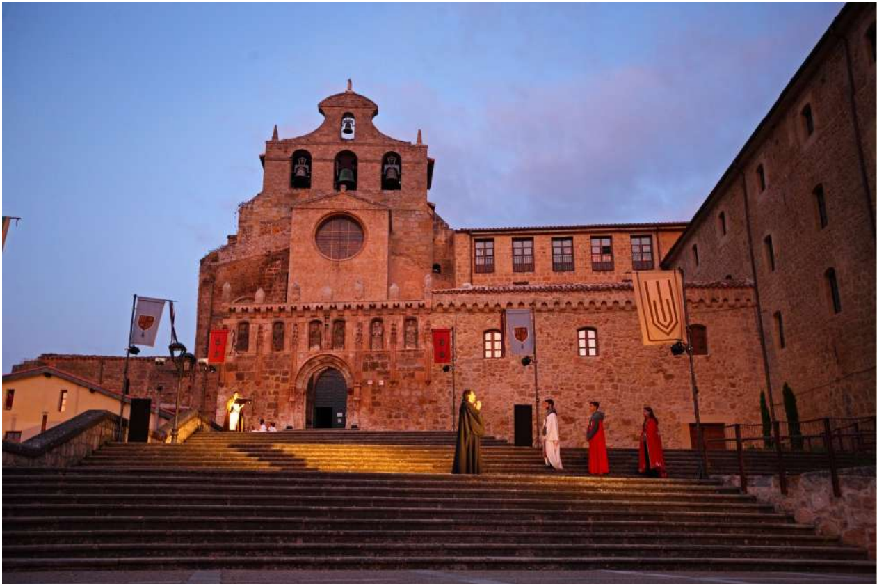
El Cronicon de Oña, Burgos