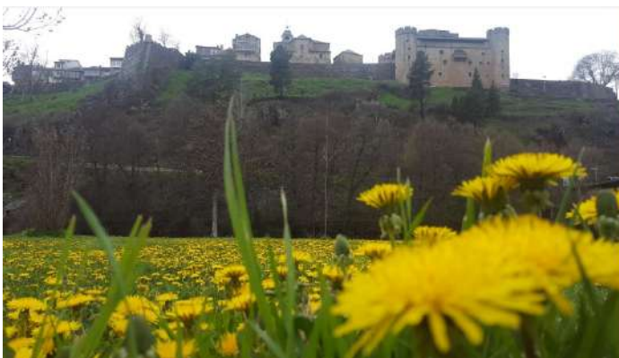
Puebla de Sanabria, Zamora