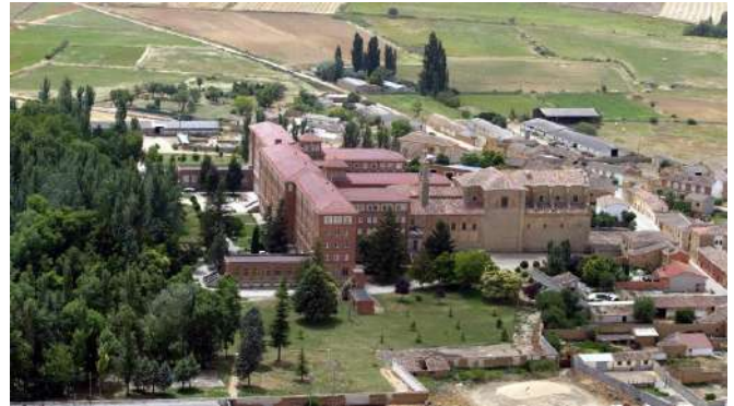
Colegiata de Villagarcía de Campos, Valladolid

Known as the little Escorial, it is located in the Montes Torozos area, just 60 kilometres from the town of Valladolid. It has a Latin cross plan, covered by a barrel vault and with three chapels on each side of the nave. It was built in the 16th century by the architect Rodrigo Gil de Hontañón, to be the tomb of Doña Magdalena de Ulloa (adoptive mother of Don Juan de Austria) and her husband Don Luis Méndez de Quijada. A novitiate school was also built next to the church. After the expulsion of the Jesuits in 1767 and the confiscation of Mendizabal, the school disappeared, leaving only the church and some remains standing, and it was a century later in 1959 when its reconstruction began. Inside we can see the altarpiece of the High Altar, with various sculptures made of alabaster, which was designed by Juan de Herrera and carved by Juan Sanz de Torrecilla. You can also visit the museum, which houses sculptures, tapestries and paintings, the hall of the founders and the room of Lepanto, as well as the crypt located under the altar.