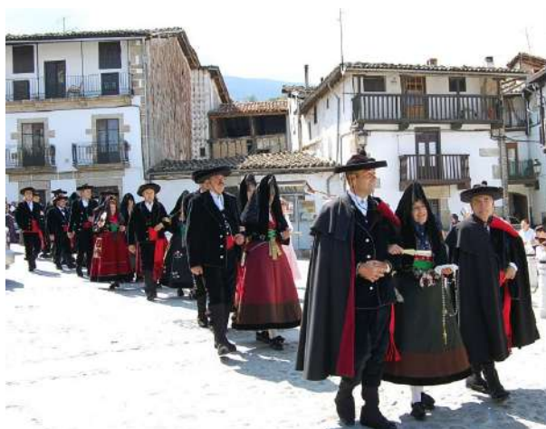
Boda típica de finales del siglo XIX en Candelario, Salamanca

On the second Sunday of August, a popular representation of the wedding rite is celebrated in the traditional way in Candelario, just as it was done at the end of the 19th century, with the bride and groom dressed in traditional costumes (the bride as a "Candelaria" and the groom as a "Choricero"). First, the "groomsmen" go to his house, and then the "bridesmaids" go to her house, and call to her from the street with a song. Then the whole entourage goes to the church for the ceremony which takes place in the portico, after which a groomsmen and a bridesmaid watch over the couple, covering them with a cloth from their shoulders and handing them a candle. At the end of the ritual, well-wishers are received at the bride's house followed by a reception during which the bride hands out segments of an orange among the guests, starting with her husband. Finally, the Tálamo is held in one of the squares, where the guests offer their gifts to the bride and groom and recite a short, comical and somewhat risqué verse.