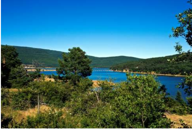
Embalse de la Cuerda del Pozo, Soria