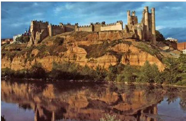
Valencia de Don Juan, León

Valencia de Don Juan marks the beginning of this route, which links this town with Castrofuerte, along the old route of the railway line that linked Medina de Rioseco with Palanquinos. The imposing Castle of Valencia de Don Juan stands on top of a hill next to the banks of the river Esla. In addition to a visit to the Castle Museum, our itinerary includes the Clothing Museum, the Church of Nuestra Señora del Castillo Viejo, the Parish Church of San Pedro and the old station, which is the starting point of our tour. The route is relatively easy, with several wooden bridges crossing small valleys and streams, and we pass by several pigeon houses of different shapes and types, as well as traditional wineries that show off their architecture. The route can be complemented with the "Paseo del Esla", a circular walk to the town of Coyan that connects with the Vía Verde. On Saturdays in July and August, the City Council of Valencia de Don Juan organises the traditional "Nights of the Castle", open-air events in the municipal auditorium, taking advantage of the castle's monumentality, where various dance, theatre and music shows are put on. Also in summer, you can enjoy its swimming pools surrounded by green spaces, a recreation area and restaurants.