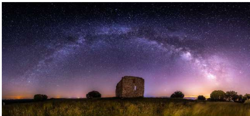
Ermita de San Cebrian, Zarzuela del Pinar, Segovia

Astrotourism is a form of sustainable tourism that combines observation of the sky (night and day) with an education in astronomy. The Starlight Foundation has certified "La Senda de los Pastores" as a Starlight Trail. To obtain this certification, the site must not only have a clear sky, but the protection of that sky must be guaranteed, and there must be adequate tourist infrastructure for the activity. It is well known among artists that Segovia has a special light in its sky. As early as the 20th century, King Alfonso X "The Wise", also known as "the Star King", observed the constellations from El Alcázar. The darkness and clarity of its night skies and the low levels of light pollution make Segovia an ideal place for stargazing. Our province has been linked to migration for a long time and stars had to be used as reference points to move the herds from the north to the south of the Iberian Peninsula. The Cañada Real Soriana Occidental runs through Segovian lands and La Senda de los Pastores, which is more than 150 km long, runs along the edge of the mountains between Riaza and El Espinar.