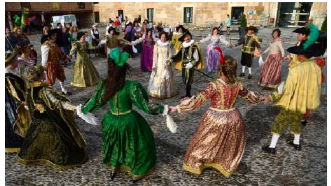
Fiesta Barroca en la localidad burgalesa de Lerma, Burgos

In the middle of August in the Burgos province, a large number of towns celebrate their festivities in honour of Our Lady of the Assumption and San Roque. The processions generate great sense of anticipation among the locals, eager to see their saints strolling through the streets, and tourists who come to the villages during August. One of the most curious festivals that we can enjoy in Burgos throughout the month takes place in the Ducal Palace of Lerma, which celebrates its traditional Baroque Festival on the 5th and 6th of August. The town is dressed in light and colour, with music and costumes from the 17th century. A typical program of the Spanish Golden Age festivities harks back to the celebrations that the Duke of Lerma, King Felipe III's favourite, used to organise. It was a way to attract the attention of the nobles, and thus make the Spanish people forget the misery and decline that the country was experiencing after the wars of the previous century. Festivals for all – perhaps the only events in which both the people and the nobility participated.