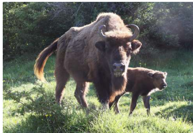
Bisontes, San Cebrian de Muda, Palencia

The European bison is a species that was on the verge of disappearance, and in fact it did disappear in Spain, despite being one of the most typical animals of the Cantabrian region. But thanks to initiatives such as the one promoted by the town of San Cebrián de Muda, these animals are starting to reproduce freely again in the reserve that this municipality has created to the north of Palencia. The first specimens, two males and five females, arrived from Poland in 2010, and fortunately the family is growing. In addition, in 2012 the first wild Przewalski horses also arrived with the same purpose of preserving this almost extinct breed, which is native to Mongolia. Before accessing the reserve, visit the "Bison Bonasus" Centre, where everything will be explained to you in detail.. You can walk, but if you want to enjoy a different and fun experience, try an electric bike or a horse-drawn carriage. If you are also a Romanesque lover, visit the Church of San Cornelio and San Cipriano, and look for the corbel depicting a bison, a testimony to its existence in the area at that time.