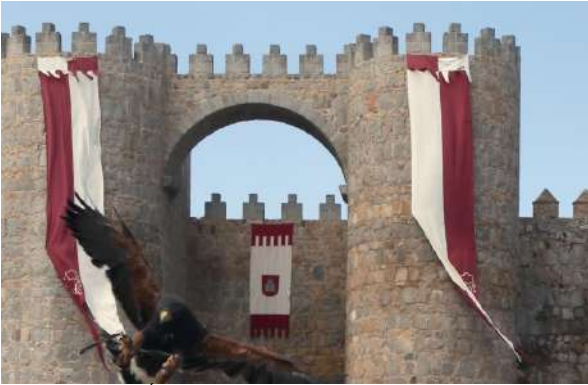
Mercado Medieval, Ávila

In the incomparable setting of the walled city of Ávila, the Medieval Days take place on the first Friday of September. On these days, which function as a sort of time machine, one feels transported into the past, to a time when three cultures lived together in this city: Christians, Jews and Muslims. These former inhabitants once again fill the streets with hustle and bustle, and the city is decked out to recreate its medieval image. You will cross paths with merchants, comedians, balladeers, fire throwers, musicians, sheriffs, silversmiths, letter writers, weavers, basket makers, toy makers and tin and nickel embossers, among others. At the same time, entertainment groups will fill the streets of Ávila with art and joy from dancers, minstrels and jugglers. In addition, you can enjoy contests and various activities, such as tournaments, concerts, exhibitions and theatre. A multitude of stalls await you, with all kinds of products as well as medieval taverns and inns to stop at on your way. Animals also play a major role, taking over the streets and filling corners with life. These spectacular Medieval Days have been declared events of Tourist Interest in Castilla y León.