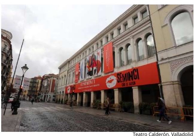
eatro Calderon, Valladolid

The Valladolid International Film Week is one of the most important film events in Spain, where the most innovative premieres in cinema are held. It takes place in October and the main venue is the Teatro Calderón. First held on March 20th 1956, at the time it was linked to Holy Week, as a week of religious cinema, however the scarcity of productions in this genre led it to evolve into its current form. During this international film festival Valladolid is full of life and film fanatics, which makes it a good time to come and visit the city. One of the most important prizes awarded at this event is the Golden Spike and the cinema award. This award has been won by such famous films as: One Flew Over the Cuckoo's Nest (Milos Forman), A Clockwork Orange (Stanley Kubrick), and Thelma and Louise (Ridley Scott).