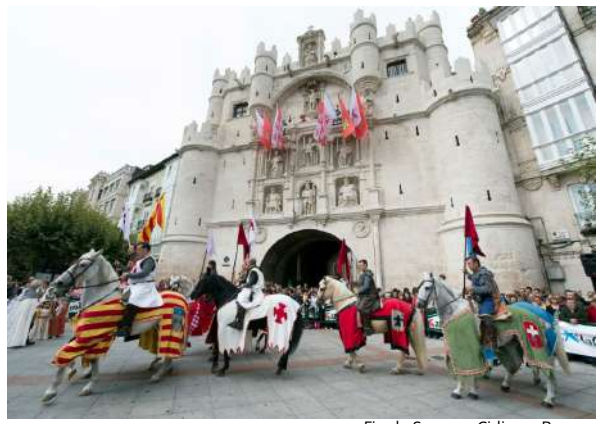
Fin de Semana Cidiano, Burgos

Rodrigo Díaz de Vivar, el Cid Campeador (a Castilian knight), is undoubtedly the most famous person from Burgos. In his honour, the city of Burgos puts on several days of events at the beginning of autumn focusing on him and the medieval world. In 2022 the festival is titled Burgos Cidiano 'El Regreso' (The Return) and will run from September 29th to October 2nd. Burgos residents and visitors alike can fully step back into the 11th century, accompanied by Burgos' most legendary son. The city's historic centre is transformed into a gigantic medieval theme park adorned with flags and banners, the streets are lively, full of parades, battles, and hundreds of participants from associations linked to the Cid Campeador and the Middle.