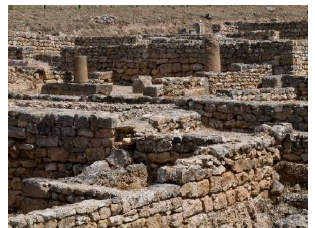
Uxama, Burgo de Osma, Soria