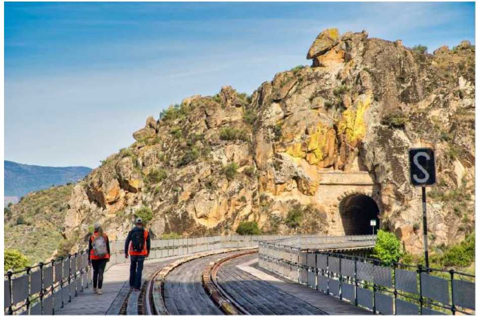
Ruta de la línea férrea de la Fregeneda. Camino de Hierro. El puente de Poyo Valiente, y tunel 7 del Pico, Salamanca