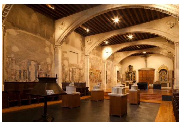
Convento y Museo de Pintura Medieval de Las Claras, Salamanca