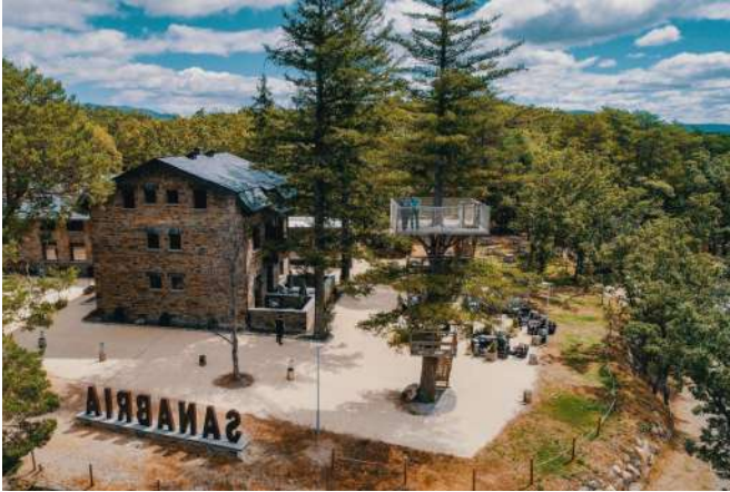
Posada Real Villa Lucerna, Vigo, Zamora