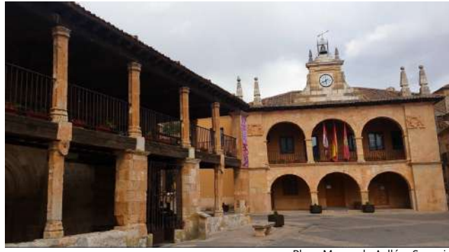
Plaza Mayor de Ayllón, Segovia

A town located in the north-east of the province, it has been a Medieval Town of National Historic and Artistic Interest since 1973. Arriving into Ayllón is a journey into the past that begins by crossing the Roman Bridge and entering the town through its Arch (the only one that remains of the three that were part of the town's walled enclosure). On it rest four coats of arms belonging to four of the most distinguished families of the area. After passing it, we come to the Palace of the Contreras family, in the Elizabethan Gothic style, the arcaded Plaza Mayor and the Palace of the Bishop of Vellosillo, an eminent theologian who represented Philip II in the deliberations of the Council of Trent and became a royal adviser. This palace currently houses the Town's Museum of Contemporary Art and the Municipal Library. But Ayllón is much more! Churches