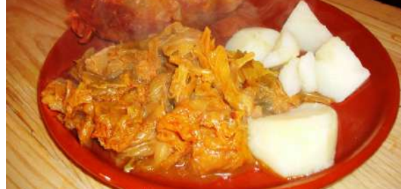
Festival de Exaltación del Botillo, Bembibre, León