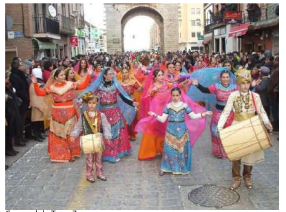
Carnaval de Toro, Zamora