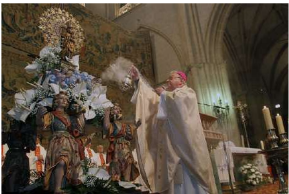
Ntra. Señora de la Calle y la Fiesta de las Candelas, Palencia

One of the festivities to which the people of Palencia are most devoted is the feast of our patron saint, the "Virgen de la Calle" (Virgin of the Street), which we celebrate on the 2nd of February. Popular legend has it that a baker tried to light his oven very early in the morning to bake bread, but had problems with a piece of wood that would not burn. After many attempts and already in a very bad mood, he threw it into the street blaspheming and there from the very log a little voice was heard saying: "Since you throw me into the street, I will call myself 'de la Calle' (Of the Streets)." And so the shape of the Virgin was sculpted in this almost burnt wood and that is why she is known as "la Morenilla" (the dark-skinned girl). When he told his wife and daughter, who were very devout, they reported the miracle to the bishop, and her festive day has been commemorated ever since. It is a beautiful celebration with the procession of the "Virgin of Nuestra Señora de la Calle" (Virgin of Our Lady of the Street) through the streets of Palencia, mass and, in the afternoon, the blessing and imposition of the Virgin's mantle on all the children born during the year so that she may protect them from any evil. You are invited to share this beautiful tradition of Palencia.