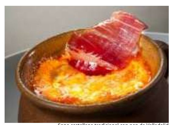
Sopa castellana tradicional con pan de Valladolic

Valladolid is known worldwide for its gastronomy, for its traditional dishes and above all for its tapas and wines, which can be tasted throughout the city in different bars and restaurants. A must is the Lechazo asado (roast lamb), usually cooked in a wood-fired oven, although it can also be eaten in other ways such as chuletillas (cutlets) or pinchos (skewers). In winter, and due to the climate of the city of Pisuerga, the most typical dish is Sopas de Ajo (garlic soup). Bread from Valladolid is a protected food product of Castile and Leon, which has had its own Guarantee Mark since 2004. As for sweet treats, the town of Portillo makes Mantecados de Portillo pastries; and in other municipalities we have Ciegas de Íscar pastries and Marinas de Medina de Rioseco cakes. There are also savoury products, such as Villalón cheese, Cigales black pudding and Zaratán sausages. Depending on the time of year, different dishes are eaten. At Easter, Torrija is typically eaten; on the 8th of September during the town's festivities, Tarta de San Lorenzo is eaten; and on All Saints' Day, Buñuelos (fritters).