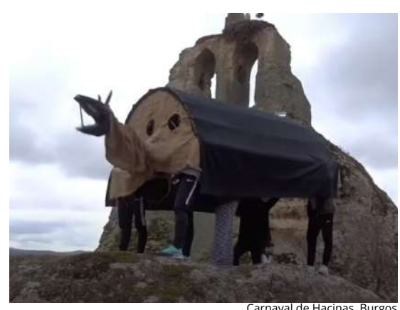
Carnaval de Hacinas, Burgos