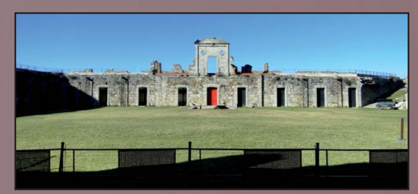
Fortress of the Conception in Aldea del Obispo.

Given his achievements, Wellington was granted control of the Spanish, Portuguese, and British armies, despite the differing objectives of the allies, which unified the war effort in the final stages. Such a display of confidence makes him the clear main attraction in the Wellington Trail , which journeys between the places where the Duke left his mark, such as barracks, churches, cities, towns, fortresses, and, of course, the battlefields where we can now find cultural resources giving us an insight into the war years