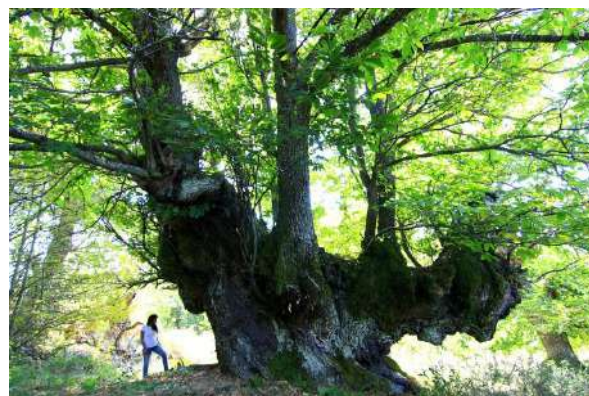
Castaños de Hermisende, Zamora

Autumn just puts you in the mood for walking out into the Sanabria countryside on a lovely hiking trail to take in the ochre, brown, and old gold colours of our forests. We recommend the "Sendero del Castañar" trail in Hermisende, which has stunning mountains, valleys, forests, and meadows and centuries-old chestnut trees whose magical energy you can feel when you touch them. It starts in the town of Hermisende. Shortly after, you find the first chestnut. This is also where you first come to the huge chestnut trees. Hermisende is the biggest producer of chestnuts in Sanabria, with production of 140,000 kilogrammes per year. You then descend to the banks of the river Pequeño and a lovely river pool, where the water runs through the mossy stones. The trail is 8km long and starts and finishes in Hermisende. It can be done in roughly three hours. There are signposts with yellow arrows to keep you on track.