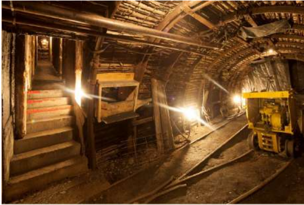
Museo Minero, Barruelo de Santullán, Palencia

Our pets are part of our family life and that's why we like to travel with them, see the world, and enjoy these places with them at our side. Here is our selection of several places in our province you can visit with your dog.