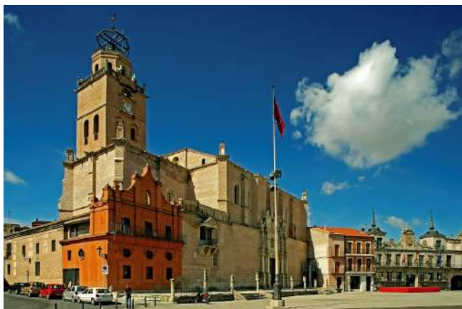
Colegiata de San Antolín, Medina del Campo, Valladolid

This town dates back to before the Romans, is located in the southeast of Valladolid province, and has an inland Mediterranean climate, with long, cold winters, and short, warm summers, and a marked difference between daytime and night-time temperatures. On 21 August 1520, royalist troops loyal to Carlos I marched to Medina del Campo to take control of the artillery stationed there. The town residents, unwilling to hand it over, formed in the square. The royalist, Antonio de Fonseca, ordered a bombardment of several areas of the town in an attempt to disperse them, but he only managed to slaughter half the population and cause the whole of Castile to rise up in revolt. The town is the birthplace of illustrious figures such as conquistadores, doctors, and even bishops, as well as three kings of Aragon: Ferdinand of Antequera, Alfonso V, and Juan II. It was also where Eleanor of Alburquerque and Isabella the Catholic died. The main tourist attractions in the town include the Castle of La Mota, the Collegiate Church of San Antolín, and the Royal Testamentary Palace. Despite all the changes the town has undergone throughout history, one thing has remained unchanged over the years: its wonderful people.