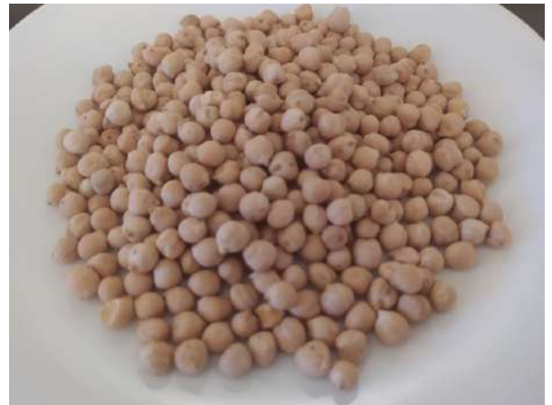
Garbanzo Pedrosillano, La Armuña, Salamanca

Chickpeas from the town of Pedrosillo El Ralo in the region of La Armuña are almost perfectly spherical, smooth, with no creases or wrinkles, and the coat is separated by a perfectly defined straight line. They have a deep creamy, slightly reddish and orangey, colour, and the grains are well shaped and do not have any physical deformities. One can taste the thin skin, the buttery texture, the smoothness, and the pleasant, intense flavour. They are the main, essential ingredient in the classic potaje de vigilia and in traditional stews. The Garbanza de Pedrosillo Certification Mark ensures a top quality product.