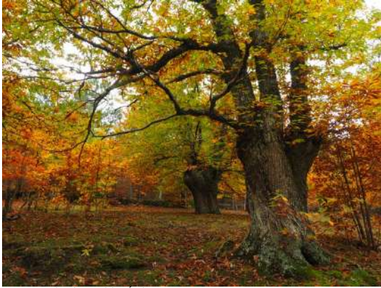
Castañar de El Tiemblo, Ávila