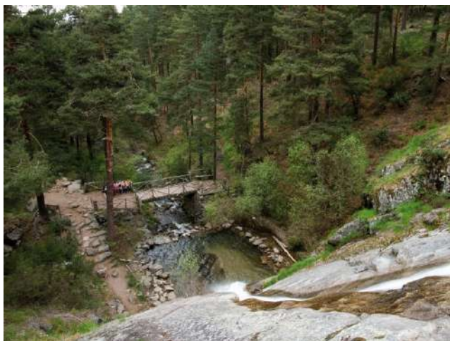
El Chorro, Navafria, Segovia

Navafría is a village nestled in the Sierra de Guadarrama offering various hiking routes in the surrounding area, including the peak of "El Nevero" (one of the tallest mountains in the range, the peak of "Picardeñas", and "El Chorro" recreation area. Take in the landscape of pines in this recreation area which has all the facilities needed to spend the day there. In summer it also has a natural pool filled by the River Cega. Leading along the river away from the pool is one of the trails suitable for all the family that takes you to the bottom of the waterfall. Before you leave this beautiful place make sure you visit the pile driver. Declared a Site of Cultural Interest in 1998, this is a Medieval hydraulic device used in copper beating. It is the only one of its kind in Europe and dates back to 1700. Today you can visit the facilities that are over one-hundred-years old. Round off your visit by trying one of the famous local caldereta lamb stews or cochifrito fried pork dishes.