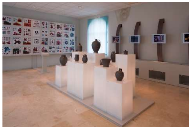
Museo Centro de la Cerámica Quintana Redonda, Soria

The Roman Villa in Cuevas de Soria boasts a series of original buildings, spa area, and over thirty rooms of different sizes with mosaic floors. This magnificent archaeological site is notable for a series of geometric mosaics in coloured pieces that show the lavish construction of the building. The Pitcher Museum in Quintana Redonda is housed in one of the old school buildings. It focuses on traditional ceramics from antiquity up to the present day: Interactive panels, audiovisual displays, posters, and multimedia resources. Visits must be booked in advance. You can also take part in a guided mushroom workshop and mushroom-picking walks in the nearby mountains run by a local company.