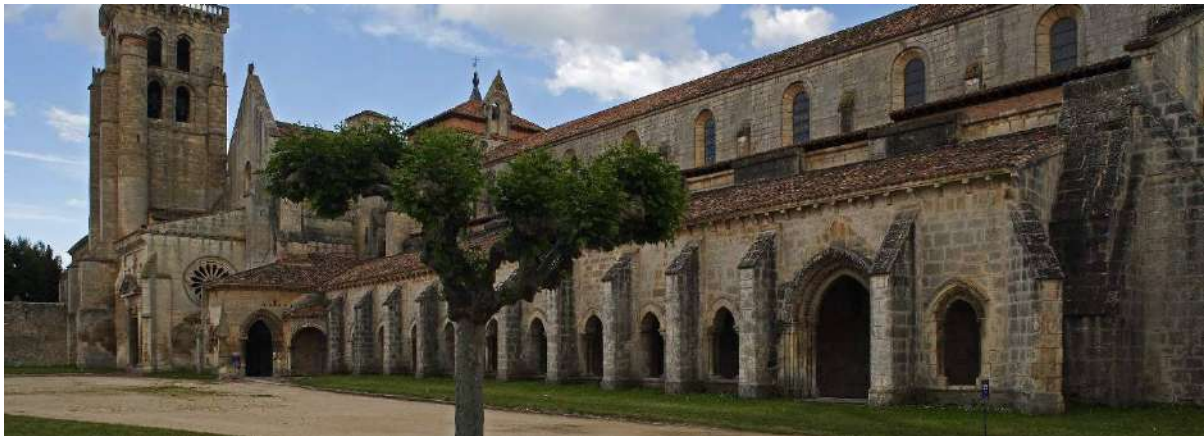
Monasterio Santa María Real de las Huelgas, Burgos

https://www.turismocastillayleon.com/turismocyl/en