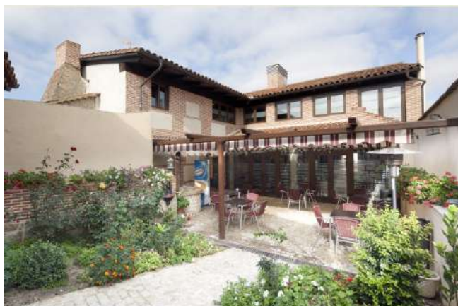
Posada Real Hosteria del Mudejar, Ávila