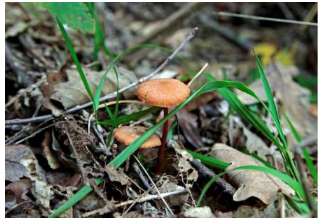
Turismo micológico, Burgos

Mushroom tours and walks are an autumn activity for all ages. Autumn, when the countryside takes on a stunning range of colours, is when there is a greater range and variety of mushrooms to be found. This activity can be enjoyed throughout Burgos province as the diversity of habitats and high rainfall in much of the region make for a great variety in mushroom species. We can find all types of fungi species in forests of Pyrenean oaks, oaks, beeches, pines, and in pastures. The areas of Demanda-San Millán, Valle de Mena, and the district of Pinares are some of the areas regulated by Micocyl, under which the mushrooms from these regulated mountains are labelled with a quality seal from the area. In autumn we can also find mushroom-based menus and events in many of the towns and restaurants and hotels in the region.