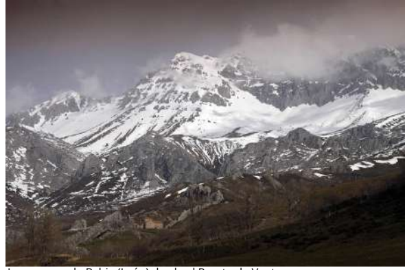
La comarca de Babia (León) desde el Puerto de Ventana