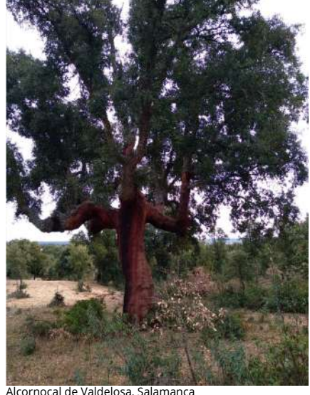
Alcornocal de Valdelosa, Salamanca

In the northern part of the province of Salamanca, some 45 kilometres from the capital, we find the Valdelosa cork oak grove. The cereal-growing landscape is interrupted by a dense forest of Pyrenean oaks, holm oaks, Portuguese oaks, and, predominantly, cork oaks. Its 6,000 hectares make it the largest cork oak grove in Castilla y León. Some 300,000 kilos of cork are extracted from it every summer when the saca, the extraction, takes place, following a rotation process, as each tree can only be uncorked every eleven years, and according to appropriate techniques that do not damage the specimens in order to maintain the activity in a sustainable manner. Within this unique forest lies the cork oak tree of Los Carretos, included in the "Living Cathedrals" route due to its age and majestic size. The route is also of great interest to birdwatchers due to the large number of species to be found throughout.