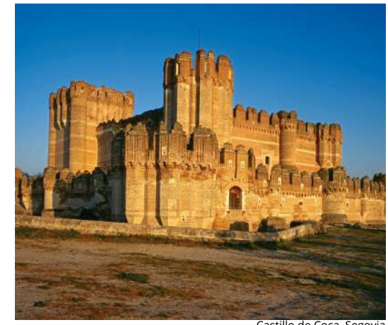
Castillo de Coca, Segovia

Located between the rivers Voltoya and Eresma, within the Tierra de Pinares, we find the so-called "Cauca", the birthplace of the Roman emperor. Theodosius the Great (last emperor of the East and West). Later, it would become the Villa de Coca, head of the Comunidad de Villa y Tierra, a form of political organisation in Castilian Extremadura, of the same name. But, without a doubt, the jewel of Coca is its Mudéjar castle, an impressive 15th-century brick building. The interior, the bridge over the moat, the parade ground, the towers (such as the keep), the chapel, the arms room and the dungeon will enchant you. We can also climb up to the parapet to enjoy the "sea of pine trees" and see the portcullis that closes the entrance gate. It is currently an Agricultural Training School. In Coca, we will also find remains of the town walls (with its Puerta de La Villa gate), the verracos vacceos (ancient granite statues representing animals), the Gothic church of Santa María La Mayor (where we can find the Renaissance tombs of the Fonseca family, who ordered the construction of the castle), the Mudéjar tower of San Nicolás (from the disappeared church of the same name and defensive watchtower of the town). Outside the wall, there are some Roman remains that are thought to be related to the villa of Theodosius the Great, located very close to here.