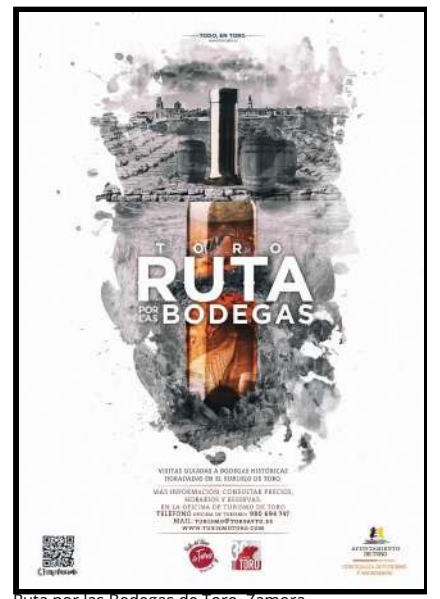
luta por las Bodegas de Toro, Zamora

The traditional wine cellars of Toro are a magnificent testimony to understanding the identity of a city that has been closely linked to both vines and wine since ancient times. They are excavated under the buildings to which they belong. Hundreds of underground spaces, often splendid and sometimes very humble, can be seen in any street or square, to the point that the most common type of civil architecture in Toro is that which includes a vent or zarzera within the elevation of the façade of the building. This architectural element is the terrestrial evidence that, for centuries, the wealth of the wine industry was a major social, economic and town-planning agent that further strengthened the historical and strategic importance that the city has had over the centuries. In 2005, after a century of neglect, the Spanish Heritage Institute launched a project to conserve the traditional wine cellars of Toro and Tierra del Vino. Five publicly owned wine cellars in Toro were chosen: those of the Town Hall, the Palace of the Counts of Requena, the Palace of Valparaíso, the Agricultural Chamber and the old Hospital.