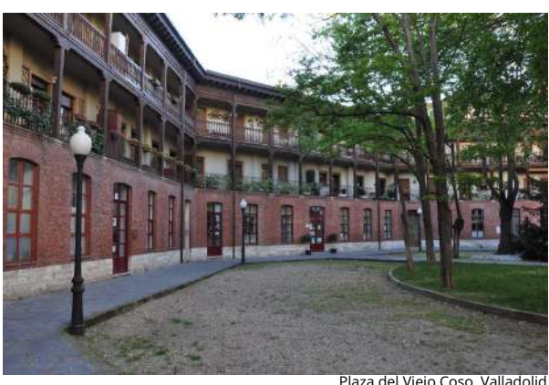
del Viejo Coso, Valladolio

The Viejo Coso Square is one of the most interesting tourist attractions in Valladolid (while also being a great unknown), not only because of its origin but also because of its architectural features. Accessed through a passageway, it amazes visitors with its impressive interior. For 60 years, since 1833, it was the first bullring in Valladolid, until 1890, when the current one on Paseo Zorrilla was built. As a result, it was abandoned and, in 1900, it was restored as a Guardia Civil, Spain's Civil Guard, barracks. After the barracks were moved to the Segovia road, it deteriorated once again, until 1982, when it was restored for residential use after being included in the catalogue of protected assets. It was one of the few octagonal bullrings in the country, along with those of Zaragoza and Granada, among others. The interior façade has been kept almost intact and all the preserved materials, such as the original brickwork, have been reused. What used to be the arena is now a wooded park, and the wooden gallery simulates a traditional corrala, the traditional communal courtyard belonging to a tenement house.