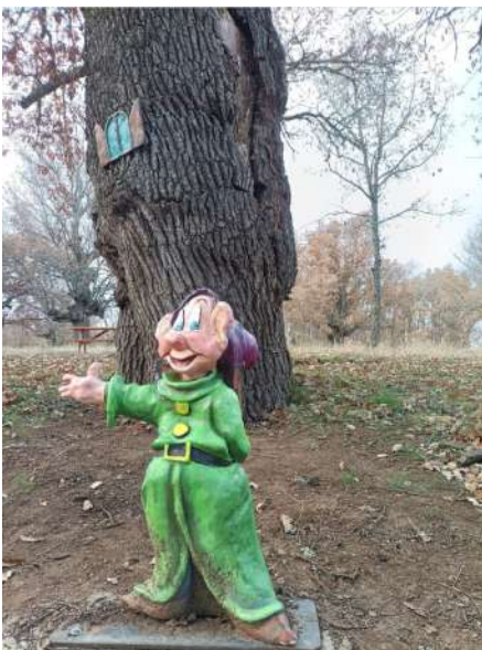
Bosque de los Enanitos, Almanza, León