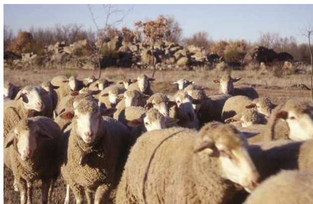
Rebaño de ovejas en la Cañada Real, Segovia

The Cañadas Reales crossed the Peninsula practically from north to south. In the case of Castilla y León, livestock farming is well known, and there are many Cañadas Reales as well as cattle trails that pass through the region. They hold great economic, geographical and environmental importance. The latter case is particularly relevant because of its protection. Nowadays, it is widely used for hiking and cycling routes. The province of Segovia is crossed by three Cañadas Reales: La Cañada Real Leonesa Oriental, La Cañada Real Segoviana and La Cañada Real Soriana Occidental. We will highlight the latter thanks to its conservation, signposting and its location along the Sierra de Guadarrama. Also known as "La Vera de la Sierra", part of the route will coincide with the GR-88 long-distance footpath. On this road we will find elements related to nomadic activity such as shearing sheds and washing places, some of which are very well preserved. In addition, a varied landscape among pines, Pyrenean oaks, junipers, holm oaks, a popular gastronomy such as caldereta, roasts, migas del pastor (shepherd's breadcrumbs). And a lot of cultural and artistic heritage; hermitages, charming villages, fountains, horseshoes, watering places, bridges. In short, a landscape to enjoy with all the senses.