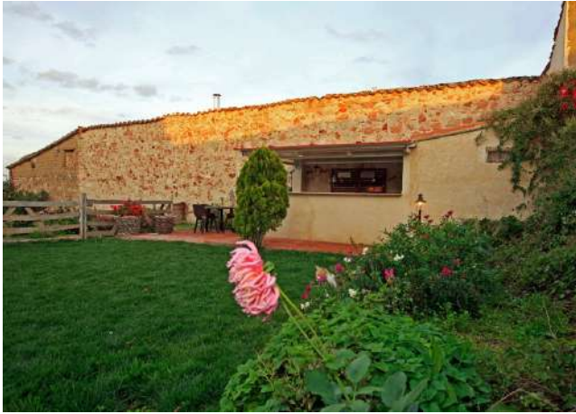
Posada Real La Posada del Buen Camino, Villanueva de Campeán, Zamora