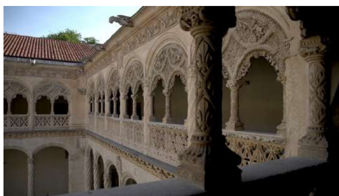
Museo Escultura, Valladolid

Valladolid has a large number of museums, housed in impressive buildings and with a rich and diverse cultural offer. We can enjoy both paintings and sculptures, as well as the buildings themselves. One of the most important is the National Sculpture Museum located in the College of San Gregorio. It is a great example of Elizabethan Gothic architecture and is considered the best in polychrome wooden religious sculpture in Europe. It possesses works by the illustrious Juan de Juni and Gregorio Fernández, among others. The Cervantes House Museum is the only house of the writer that has been preserved in Spain. Living here, he managed the publication of the first part of the successful novel Don Quixote de la Mancha. Nor should one forget the Museum of Valladolid in the Palace of Fabio Nelli which houses a large collection of archaeology, and is an area dedicated to historical and artistic pieces from the Valladolid province. These are just a few of the many museums that there are to visit, both in the city and in the province.