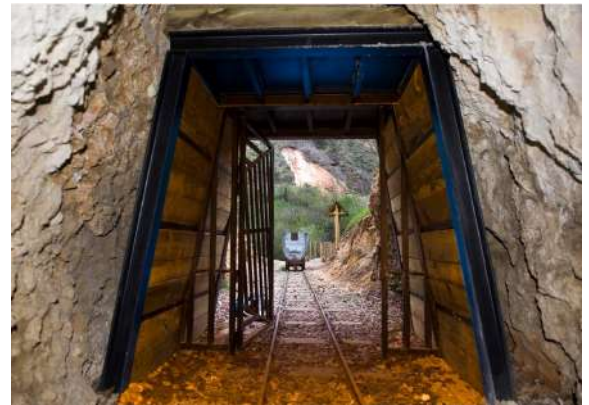
Mina, Puras de Villafranca, pedanía de Belorado, Burgos

Between the towns of San Adrián and Brieva de Juarros runs the Mining Path, the most famous hiking route in the region of Juarros due to the ease of the route and the curious enclaves to be discovered. This was a mining area throughout the second half of the 19th century and until the 1970s, where vast quantities of coal were extracted. Along the route we will find remains of this extractive activity: 9 coal mine shafts, a limekiln, also related to mining activity, and other sites such as the Brieva mill. The well-marked route runs through cattle grazing areas as well as oak and pine forests. There are information panels in many places explaining details about mining in the Juarros region. Perhaps the most famous place on the route is the well of San Ignacio, with a depth of 200 metres, and is very close to the village of San Adrián de Juarros.