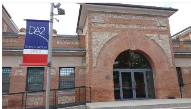
Domus Artium 2002, Salamanca