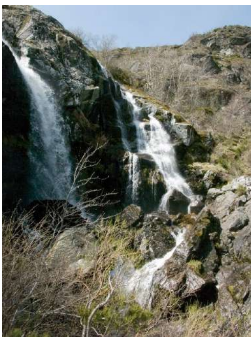
Cascadas de Sotillo, Sotillo de Sanabria, Zamora

It is a 7 km route (round trip), medium difficulty. It is marked with brown beacons. It can be done all year round, especially in spring and autumn. It is one of the most beautiful routes in the Natural Park and possibly one of the best known. The route starts in Sotillo de Sanabria where we leave the car, near the bridge over the river Truchas. We will start walking along the paved path, often accompanied by water that will lead us to the waterfalls. This path starts on the left hand side and will be marked by brown markers, once on the path there will be no issue of getting lost until we reach the Sotillo waterfalls. During the ascent, which is somewhat difficult due to the rocks, we will be able to admire truly virgin forests with species such as holly, oak, chestnut and hazel trees. Before we can see the waterfalls, we will hear the sound of the water falling into the Truchas River, but be careful with the steep slope that will lead us to the river. The water of the Cascadas de Sotillo comes from the Sotillo Lagoon, which is 1,600 metres above sea level.