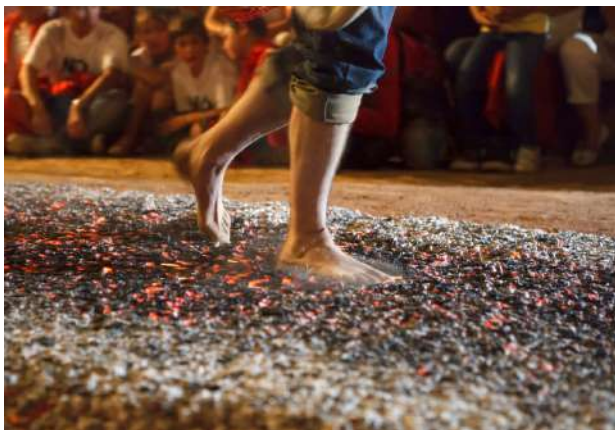
Tradicional Paso del Fuego en San Pedro Manrique, Soria