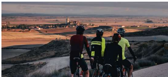
Ruta Cyclope, Palencia

If you love cycling, routes, challenges, heritage, nature and good gastronomy, this is a great route. "Cyclope" offers you the chance to discover our province while embracing your passion for cycling with various events. The first of these events is "Palencia Roud", through 5 days of road with 481 km and a positive difference in altitude of +4.059 metres that will take you from the endless plains of Tierra de Campos to the impressive Palencia Mountains. The second, "Palencia Gravel", involves 7 stages with 586 km and a positive difference in altitude of +5,431 metres along paths with either a mining past or those of the wine-making tradition. But if you want more "Road Bike Stages", there are 6 destinations throughout the province of Palencia where you will find places prepared to host club rallies and training camps depending on the training objectives. And if you like the thrill of racing against your own records or trying to beat your competitors' times, the "Road Racing Series" is the challenge for you.