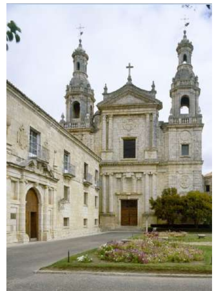
Iglesia La Santa Espina, Valladolid

This Cistercian monastery is located 43.5 km from the capital of Valladolid, in the town of La Santa Espina, municipality of Castromonte. It was ordered to be built in 1147 (12th century) by Doña Sancha of Castile, with the intention of housing the donation made to her by the French king, Louis the Younger, which consisted of a thorn from the crown that Jesus Christ wore on the day of his passion and death, from which the monastery takes its name. This thorn is found in one of the chapels, that of the relic, which was designed by Francisco de Praves (a disciple of Herrera) in the 17th century. The building has undergone variations since its inception, a fire, the French invasion and even the confiscation of Mendizábal. Today it is walled in its entirety with a 15th century rampart, which has an arch through which you can access the interior, flanked by two towers. It has two cloisters, the hospice (Herrerian) and the regular cloister (Romanesque). The church has a polychrome wooden altarpiece from the 16th century. It currently has an Agricultural Training Centre in which different courses are given.