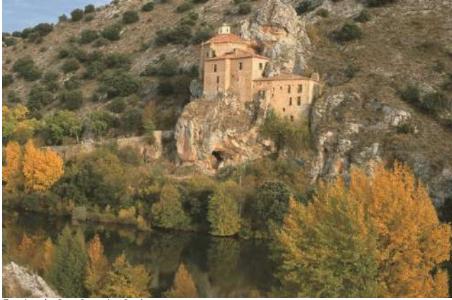
Ermita de San Saturio, Soria