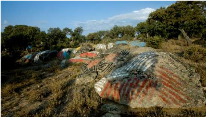
Ibarrola en Garoza, Ávila