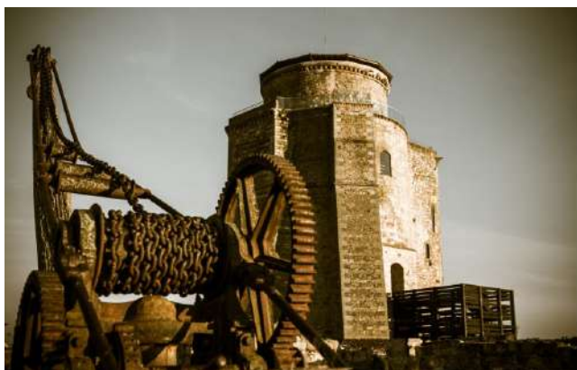
Torre del Homenaje Castillo Duques de Alba, Salamanca

You are invited to discover the keep of the Castle of the Dukes of Alba. Inside you can visit several rooms, such as the one with the frescoes of the battle of Mühlberg and go up to the belvedere from where you can see the village. Outside are the ruins of the archaeological excavations that have been gradually uncovering the former splendour of the castle, of which only this tower remains today. In 1429, Juan II of Castile granted Alba de Tormes to Gutiérrez Álvarez de Toledo, of the House of Alba, who ordered the construction of a Tower-Fortress as soon as he took possession. His successors carried out extension works, but it was Fernando Álvarez de Toledo, the Grand Duke, under whom the castle was adorned with the finest marble, paintings, and tapestries, making it one of the most sumptuous in Spain. Its walls housed illustrious guests such as Lope de Vega, Calderón de la Barca and Garcilaso de la Vega.