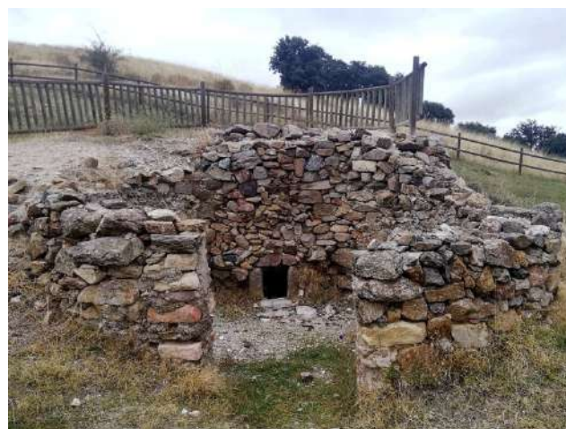
Horno de cal, Vegas de Matute, Segovia

At the foot of the Sierra de Guadarrama is the town of Vegas de Matute. On the outskirts of this town, we find the Zancao Lime Kilns, winner of the Fuentes Claras environmental award for the sustainability of small municipalities. It is possible that there was an earlier lime kiln, but it was in the 16th century when its production intensified for the construction of the monastery of El Escorial. The manufacture of lime is a simple process, but the peculiarity of these kilns compared to others is the use of portals or pits. These were used as a shelter for the lime burner, who had to administer the necessary fuel and keep an eye on the temperature of the kiln on firing days. The whitest and purest stones were chosen from the nearest quarries and mountains, and bushes and broom were used as fuel, even from the pine forests of the Alto del León. Very close to the oldest kilns, an aqueduct has been preserved that carried water from the northern slope of Los Calocos to the village. To complete our visit to this town, the Gothic church of Santo Tomas of Canterbury, the work of Juan Gil de Hontañón, and two old palaces from the 16th century are must-sees.