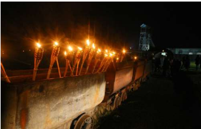
Procesión nocturna de Santa Bárbara, pozo Julia, Fabero, León

The Fabero mining basin, in the region of El Bierzo, has been declared an Ethnological Site of Cultural Interest. It is made up of a large number of enclaves scattered throughout the municipality, which is of great heritage interest. One of the main mines is the Pozo Julia, whose construction dates back to 1947. After the disappearance of production activity and its closure in 1991, the former miners wanted to keep the memory of everything that mining had brought to the area alive. In 2007, the facilities were transferred to the Fabero City Council, who turned it into a space to illustrate the reality of mining in this basin. It is a large vertical shaft 275 metres deep accessed by a derrick with a lift and wagons, which is the most characteristic image of this mine. Visitors can now enjoy an hour-long tour where they learn about the working conditions of the miners, as well as their daily activities, visiting areas such as the lamp shop, the doctors' area, or the compressor room with machinery from the 1960s, as well as a faithful recreation of the mine.