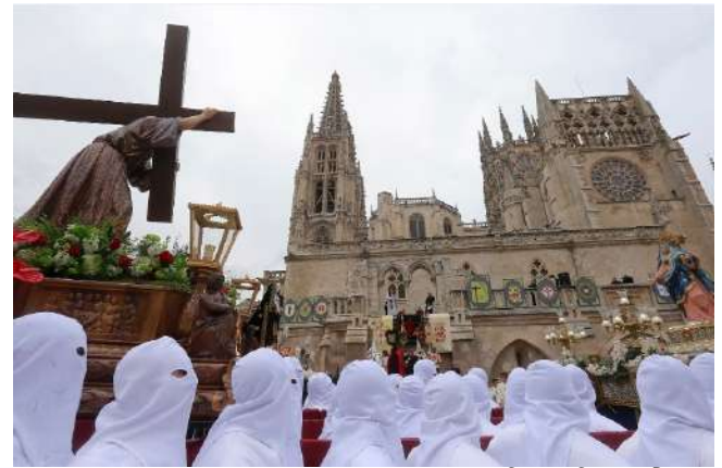
Semana Santa en Burgos