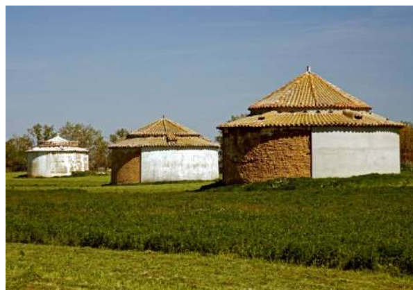
Palomares en Tierra de Campos, Palencia