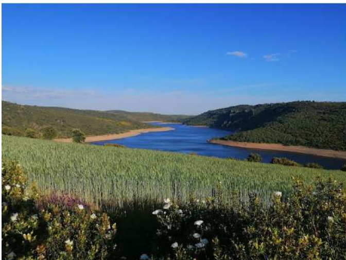
Embalse del Esla, Peña Valdoradas, Carbajales de Alba, Zamora

28 kilometres from Zamora is Carbajales de Alba, located on the shore of the Esla reservoir and immersed in the Tierra de Alba. The typical embroidery is well known here, including the colourful carbalina costumes, which have been made since the 16th century and won international awards. In the surrounding area we find such marvellous spots as Peña Valdoradas, which invites us to take a beautiful hiking route among rockroses, with a wonderful view of the reservoir. Associated with the rockrose is the "boletus edulis", a highly prized mushroom that is found almost exclusively in the rockrose fields of Almería and Tabares. It is interesting that all over Europe the "boletus" of the rockroses is already called "zamoránitos". They are smaller boletus, more aromatic, very tasty, and withstand the cold better.