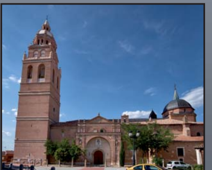
Choose your excuse to visit the sites where the guerrilla fighters fought and took shelter.

Paying your respects at the tomb of El Charro in Ciudad Rodrigo, staying in the Parador hotel there, and visiting the Peninsular War exhibition in the Palace of Los Águila. Exploring the nearby Archaeological Site at Siega Verde or the castle in San Felices de los Gallegos. Walking around the battlefield of the Battle of Salamanca and discovering the Interpretation Centre with Primer Edecán. Enjoying the views from the top of the Keep in Alba de Tormes. Treating yourself to some delicious food and drink on the Wine Routes in Cigales, Ribera del Duero, Toro, and Rueda. Spending the night at the Jardín de la Abadía Hotel in Arrovo de la Encomienda, close to Valladolid.