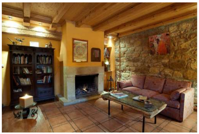
Posada Real La Posada del Pinar, Pozal de Gallinas, Valladolid