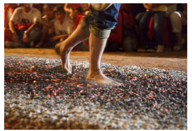
Tradicional Paso del Fuego en San Pedro Manrique, Soria