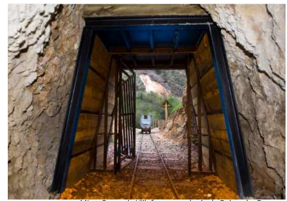
Mina, Puras de Villafranca, pedanía de Belorado, Burgos

Between the towns of San Adrián and Brieva de Juarros runs the Mining Path, the most famous hiking route in the region of Juarros due to the ease of the route and the curious enclaves to be discovered. This was a mining area throughout the second half of the 19th century and until the 1970s, where vast quantities of coal were extracted. Along the route we will find remains of this extractive activity: 9 coal mine shafts, a limekiln, also related to mining activity, and other sites such as the Brieva mill. The well-marked route runs through cattle grazing areas as well as oak and pine forests. There are information panels in many places explaining details about mining in the Juarros region. Perhaps the most famous place on the route is the well of San Ignacio, with a depth of 200 metres, and is very close to the village of San Adrián de Juarros.