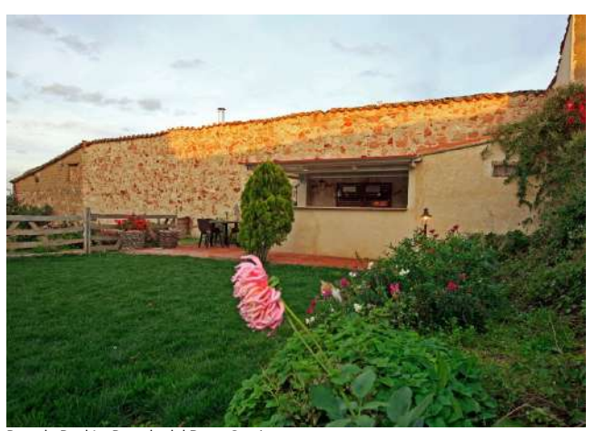
Posada Real La Posada del Buen Camino, Villanueva de Campeán, Zamora