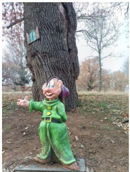
Bosque de los Enanitos, Almanza, León

There is a very special forest only 60 km from León. A charming and easy route to do with the little ones as a family. The Forest of the Dwarfs in Almanza. Among oak trees, a total route of only 2.2 km, you can discover all the dwarfs, and the witch. You can even see the three little pigs and the big bad wolf. It is signposted so there is no way to get lost, and with a convenient car park to leave your vehicle and enter the forest, this is a very pleasant route to enjoy together. You can take a snack with you, there are picnic tables, a swing, and - taking advantage of the fact that you have travelled to Almanza - you can take a walk through the historic centre which has been declared a Medieval Historic Site.