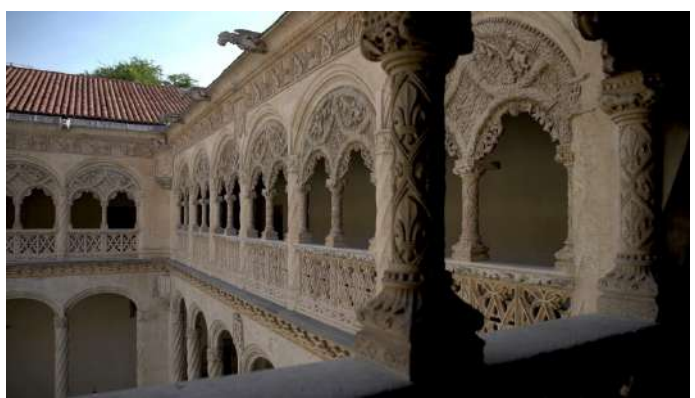
Museo Escultura, Valladoli

Valladolid has a large number of museums, housed in impressive buildings and with a rich and diverse cultural offer. We can enjoy both paintings and sculptures, as well as the buildings themselves. One of the most important is the National Sculpture Museum located in the College of San Gregorio. It is a great example of Elizabethan Gothic architecture and is considered the best in polychrome wooden religious sculpture in Europe. It possesses works by the illustrious Juan de Juni and Gregorio Fernández, among others. The Cervantes House Museum is the only house of the writer that has been preserved in Spain. Living here, he managed the publication of the first part of the successful novel Don Quixote de la Mancha. Nor should one forget the Museum of Valladolid in the Palace of Fabio Nelli which houses a large collection of archaeology, and is an area dedicated to historical and artistic pieces from the Valladolid province. These are just a few of the many museums that there are to visit, both in the city and in the province.