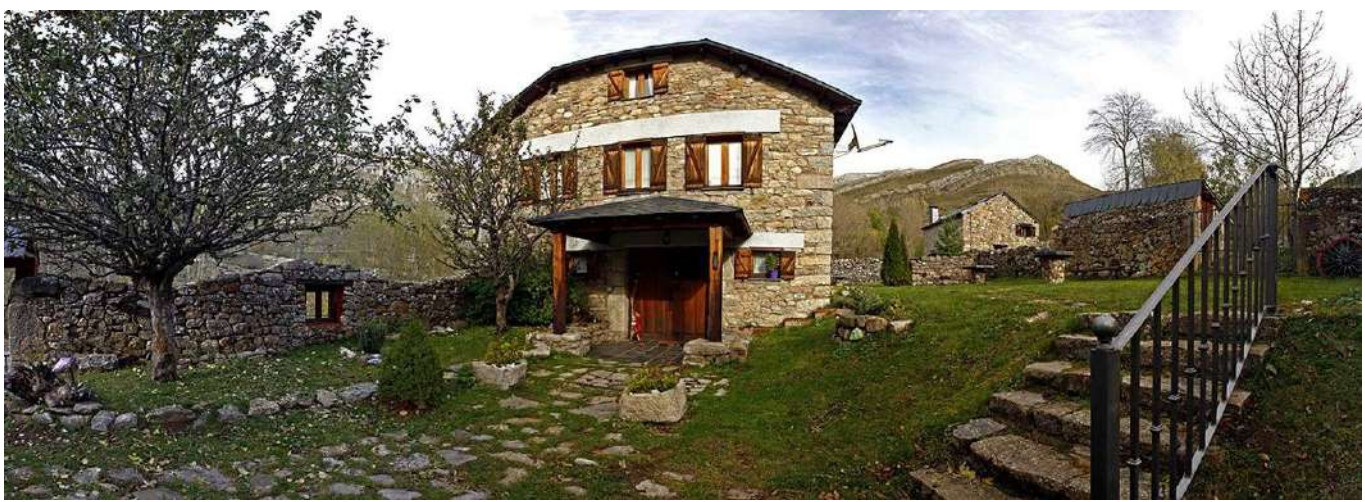
Posada Real el Rincon de Babia, La Cueta, León