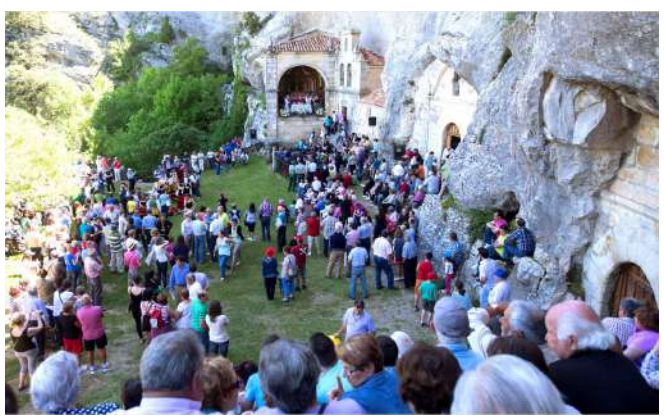
de San Bernabé en Merindad de Sotocueva, Burgos

The Ojo Guareña Natural Monument is one of the most outstanding scenic settings in the province of Burgos. On the Saturday following the 11th June, the people of Merindad de Sotoscueva celebrate their unique pilgrimage to the curious cave chapel of San Bernabé. The festival, declared to be of Tourist Interest in Castilla y León, begins around the sacred holm oak tree, where the rulers of Merindad used to hold their meetings. There, the authorities sign the books of honour and the "Carbonero Mayor" (chief charcoal burner) is elected. Then, next to the chapel-cave, a countryside mass is held where a large number of people attend. At the end, traditional folklore groups perform different dances to the delight of those present. The pilgrims, who come from a wide variety of places, enjoy their food in the nearby fields and in the afternoon the festivities continues with popular music and various competitions.