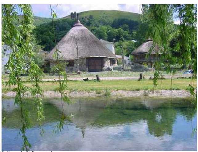
Palloza de Balboa, León