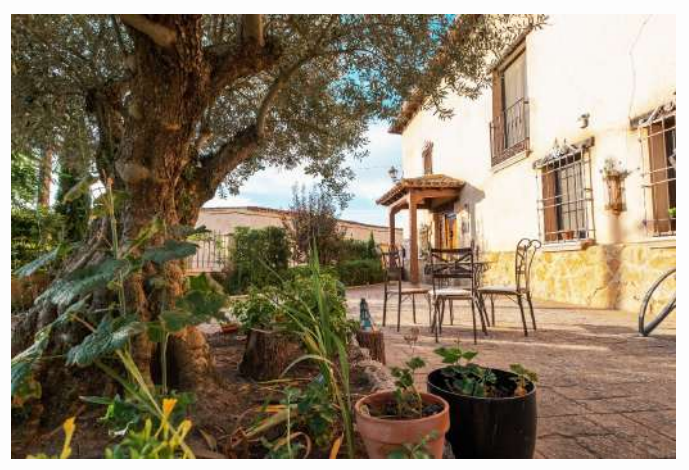
Posada Real La Posada del Canal, Villanueva de San Mancio, Valladolid