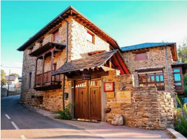
Posada Real El Sendero del Agua, Trefacio, Zamora