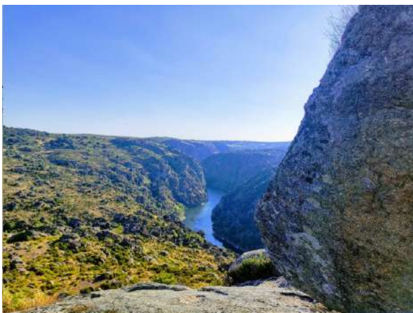
Mirador de Peña Redonda. Villardiegua de la Ribera, Zamora

Peña Redonda (Round Rock) is, as its name suggests, a great granite stone around which a Celtic tribe settled more than two thousand years ago. Later, the settlement was inhabited by the Romans. The site here is one of the most impressive viewpoints of the Arribes del Duero. Behind the canyon, which opens up before us in its entirety, you can make out the houses in the Portuguese town of Vale de Águia. The viewpoint can be reached by car. On the way up to the much anticipated views, you will find the remains of the medieval hermitage of San Amede, where a shrine was built in the surroundings in which, according to some archaeologists, different rituals and sacrifices were carried out. From here it is worth going on to the crossroads where the Ribera de los Molinos path starts. A stretch of great beauty where you will discover 9 watermills that zigzag along the Pontón stream and lead you to another spectacular spot over the Arribes del Duero.