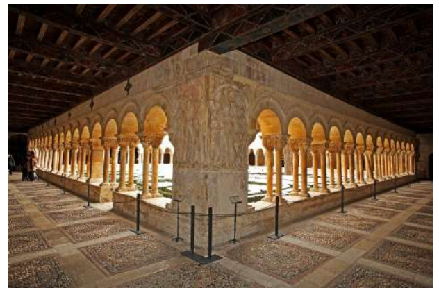
Claustro de la Abadía Benedictina. Sto Domingo de Silos, Burgos

On the last Saturday of January, the Fiesta de los Jefes (The Boss' Celebration) is held in the beautiful town of Santo Domingo de Silos, which has been declared a regional tourist attraction. It is one of the most unique winter festivals in our province that has its roots in the Muslim invasion of the Peninsula, when legend has it that a Moorish army besieged the town, and the people of Silos pretended there was a fire so that the enemy would think it was pointless to continue with the siege. The complexity of the festival and its ethnographic variety constitute a ritual that blends various traditions and origins, some historical, others imagined, all of which possess an anthropological double meaning that is as exciting as it is intricate, making this celebration one of the most notable in the Burgos area.