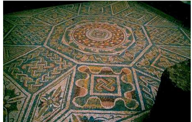
La Olmeda, Palencia

The Roman villa of La Olmeda was discovered by chance, by D. Javier Cortes, on July 5, 1968, while doing agricultural work. Since then, intensive work has been carried out at all levels on this magnificent Roman site, leading up to the major work undertaken in 2009 by the Provincial Council, which has made it a global benchmark. It is popularly known as the "Guggenheim of the Romans" as it perfectly combines contemporary architecture with a site from the 4th century AD. You will be amazed by all the rooms in this house, which covers 6,000 m 2 , 1500 of which are made up of geometric and figurative mosaics with hunting scenes, mythological scenes or the seasons of the year. All the archaeological remains are kept in the Saldaña Museum, which can also be visited.