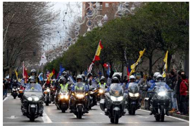
Los Pingüinos, Valladolid

Since 1982, over four days from Thursday to Sunday on usually the second weekend after Three Kings Day, Europe's biggest winter biker rally has been held in the province of Valladolid, which motorcycle fans flock to from all over the world. At the last event, there were 33,000 registrations and this year, which is the 40th anniversary and comes after last year's edition was cancelled due to the pandemic, even greater numbers are expected. If you have never heard of penguins, I'll tell you some of the most important aspects. In the pine forest, the participants set up tents around bonfires which firewood is provided for. Coffee made in a pot is also served, which is a welcome warming drink given the low temperatures at this time of year, at breakfast and dinner. There are bars, restaurants, merchandise shops... Among the many activities, there are concerts almost all the time, the famous parade of flags in the centre of Valladolid, and the New Year's Eve and Penguin New Year's party, where pine nuts are eaten at every stroke of the midnight bells instead of the traditional grapes. Whether you are a motorcycle fan or not, this is a must-see event.