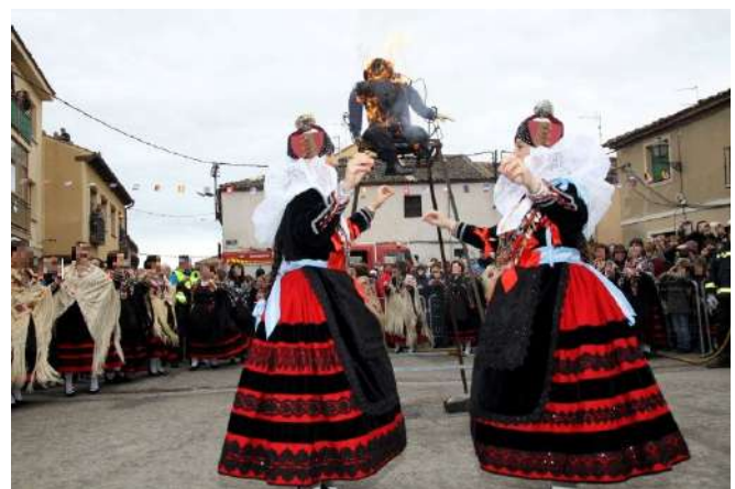
Fiesta de Santa Águeda. Zamarramala, Segovia

Saint Agatha, a Sicilian-born martyr, is considered the protector of pregnant women, nursing mothers, and women in general. The origin of this festival in Zamarramala, which seems to have been celebrated since 1227, is linked to the conquest of El Alcázar. The women of Zamarramala, dressed in their best clothes at sunset, managed to distract the guards with their dances and thereby allowed the men of the town to conquer El Alcázar. Among the privileges they earned for themselves was that women got to be in charge once a year. Although this celebration has undergone changes, the spirit of it remains the same. Declared a Regional Tourist Attraction, it lasts for several days, although the day that draws the most interest is the Sunday after February 5th. On that day, you can accompany the Mayor and the aguaderas (water sellers) after mass in the procession, the pledge of allegiance, dances, the opening speech, the awarding of the "Good and Loyal Man", "Mankiller" and "Honorary Aguaderas" prizes and, of course, the burning of the effigy. After these activities have concluded, you simply must try the famous "tajada de chorizo" chorizo slice cooked in wine.