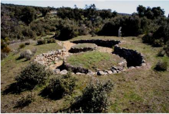
Castro de la Mesa de Miranda, Ávila

The pre-Roman fort of La Mesa de Miranda was discovered at the beginning of the 20th century. Various archaeological surveys have been carried out there that have allowed us to discover its necropolis, through the excavation of 2,230 tombs, its defensive system and strategy and some aspects of the layout of the town. It is 2 km from the historic centre of Chamartín, along a road that can be accessed by vehicle, although a walk through the landscape of centuries-old holm oaks is advisable. It is an official Asset of Cultural Interest in the Archaeological Zone category. It was inhabited by the pre-Roman Vettones between the 5th to 9th and 2nd to 1st Century BCE, who would leave the site due to the increasing Roman presence in the inner lands of the Iberian Peninsula. It consists of three joined fortified enclosures in a 30 ha area and a necropolis close to the enclosures. It is equipped for public visits. Its most notable characteristics are its strategic position between two waterways, the heavy fortification, suggesting a violent time, the importance of the cult of the dead that is evident in the necropolis and the characteristic landscape of holm oaks on the very edge of the plain of the Duero valley which is a wonderful sight for visitors to enjoy. In Chamartín you can see one of the characteristic stone bulls, which are typical of the Vettones.