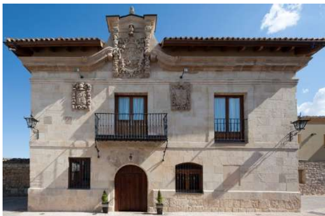
Posada Real Concejo Hospederia, Valoria la Buena, Valladolid