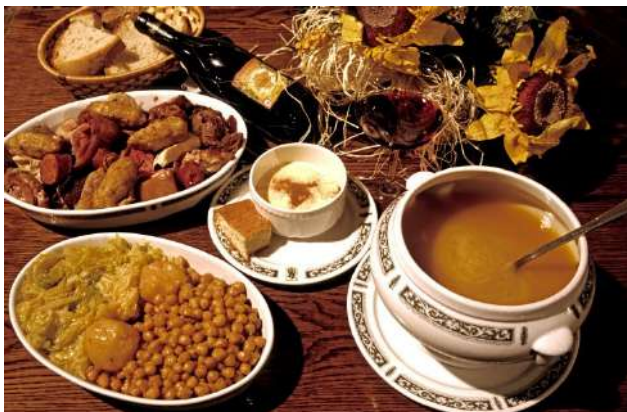
Cocido Maragato, León

Stews are one of the most characteristic dishes of León. In the province of León different types of stew can be found. There are almost as many as there are regions: the Leonese, the Maragato, the Gordonese, the Riaño mountain pea one, the Babiano, and many more. Perhaps the most famous of all of them is the Maragato. It is the one eaten in the Maragatería region, in towns such as Astorga, Castrillo de los Polvazares, Santiago Millas, and La Somoza. The quirk is that it is eaten backward compared to other places: first the meats (at least seven), then the chickpeas, of the pico pardal variety, with the vegetables and the filling, the noodle soup, and finally the broth. It is not clear how it came about, but we do know that it was the quintessential peasant dish of the region. The fact of the matter is that the Maragatos, as good muleteers, carried the meats in their packs on their trips and when they finished eating, they would drink a broth to warm up. A local saying sums it up well: "If anything is to be leftover, let it be the soup."