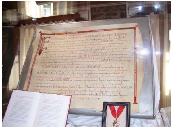
Fuero de Brañosera, Palencia

Brañosera is a beautiful town nestled in the Palencia Mountains. It is believed to have the oldest town council in Spain, as evidenced by the municipal charter granted on October 13th 824, which mentions the town under the name of Brannia-Ossaria, which means land of brañas (pastures) and bears. The charter was granted by Count Munio Núñez and his wife Argilo to entice settlers to the area. They granted their subjects rights such as free use of the entire valley, albeit with two conditions. Firstly, they had to share part of the freedom of use with whomever wanted to come and settle in the valley. Secondly, they were to give the Count half of what they were paid by the inhabitants of the nearby towns for letting their livestock graze on the lands. The charter is kept in Brañosera's town hall and can be visited free of charge with a booking made in advance by calling 979 606 277 between 11:00 a.m. and 2:00 p.m.