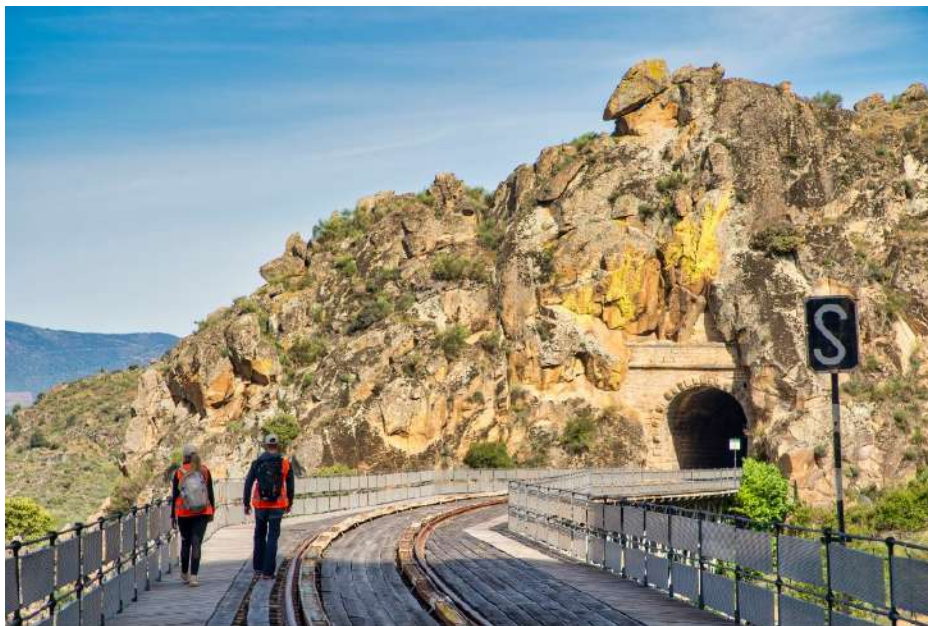
Ruta de la línea férrea de la Fregeneda. Camino de Hierro. El puente de Poyo Valiente, y tunel 7 del Pico, Salamanca