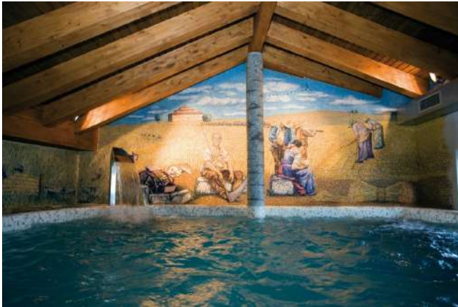
Posada Real Los Condestables, Villalpando, Zamora