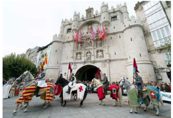
Fin de Semana Cidiano, Burgos

Rodrigo Díaz de Vivar, el Cid Campeador (a Castilian knight), is undoubtedly the most famous person from Burgos. In his honour, the city of Burgos puts on several days of events at the beginning of autumn focusing on him and the medieval world. In 2022 the festival is titled Burgos Cidiano 'El Regreso' (The Return) and will run from September 29th to October 2nd. Burgos residents and visitors alike can fully step back into the 11th century, accompanied by Burgos' most legendary son. The city's historic centre is transformed into a gigantic medieval theme park adorned with flags and banners, the streets are lively, full of parades, battles, and hundreds of participants from associations linked to the Cid Campeador and the Middle.