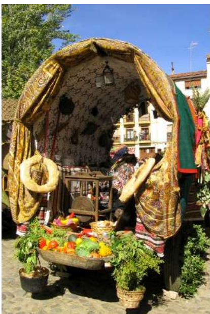
Fiesta de San Froilan, León