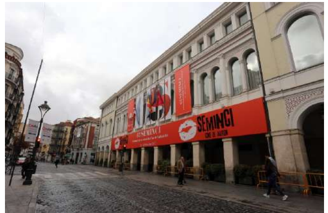
Teatro Calderón, Valladolid

The Valladolid International Film Week is one of the most important film events in Spain, where the most innovative premieres in cinema are held. It takes place in October and the main venue is the Teatro Calderón. First held on March 20th 1956, at the time it was linked to Holy Week, as a week of religious cinema, however the scarcity of productions in this genre led it to evolve into its current form. During this international film festival Valladolid is full of life and film fanatics, which makes it a good time to come and visit the city. One of the most important prizes awarded at this event is the Golden Spike and the cinema award. This award has been won by such famous films as: One Flew Over the Cuckoo's Nest (Milos Forman), A Clockwork Orange (Stanley Kubrick), and Thelma and Louise (Ridley Scott).