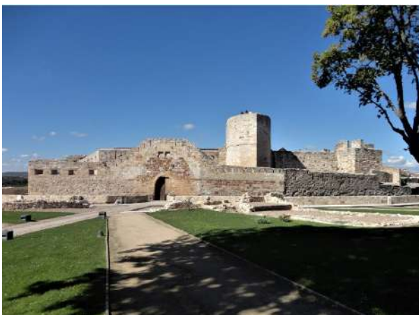
Castillo de Zamora