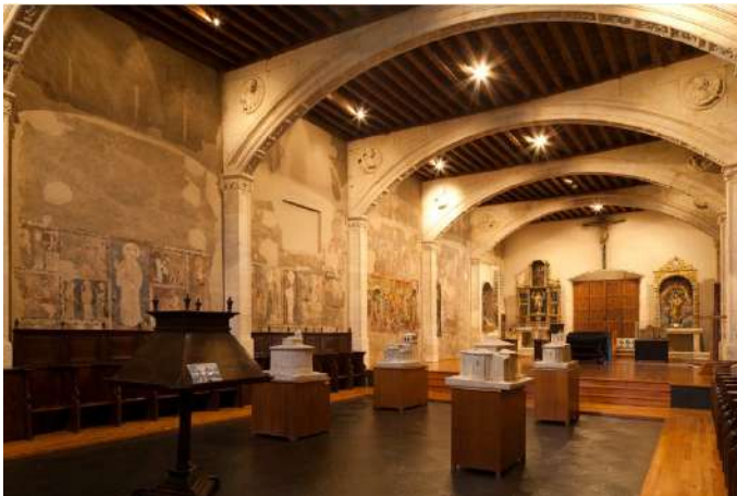
Convento y Museo de Pintura Medieval de Las Claras, Salamanca