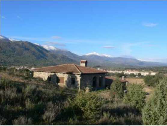
Museo de la Naturaleza Valle del Alberche en El Barraco, Ávila