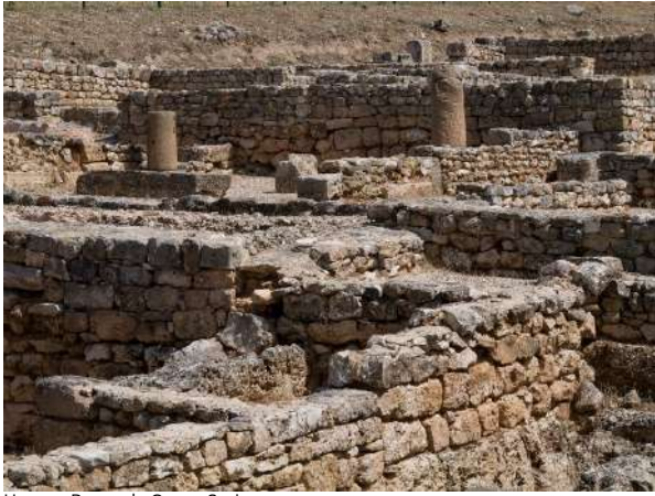
Uxama, Burgo de Osma, Soria