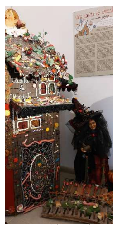
Museo de los Cuentos y la Ciencia, Paredes de Nava, Palencia

For enquires about opening hours, prices, and more information: