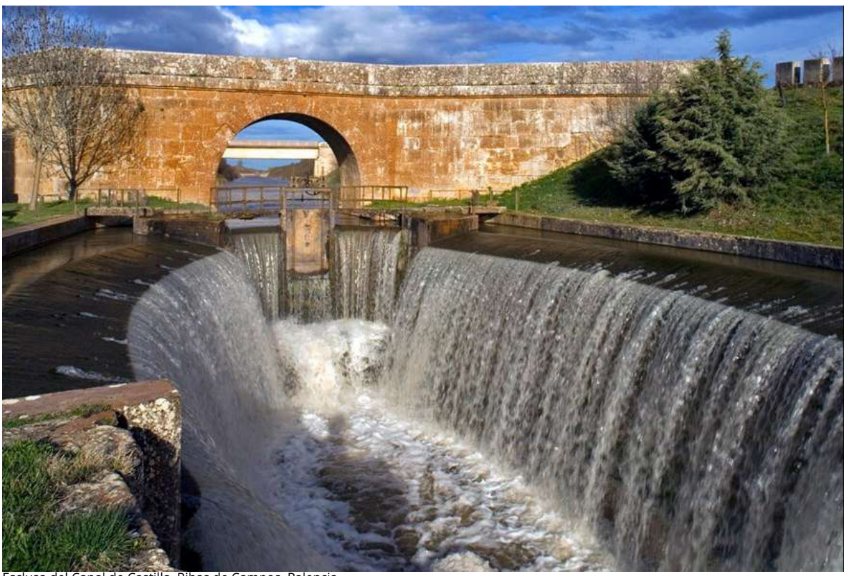
Esclusa del Canal de Castilla, Ribas de Campos, Palencia