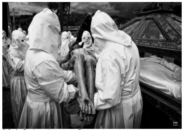
Cofrades Bercianos viernes santo, Zamora