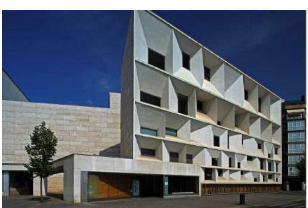
Auditorio Ciudad de León