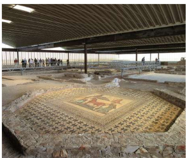
Museo Villas Romanas, Almenara, Valladolio

The Museum of Roman Villas and the Roman Villa in Almenara-Puras were classed as "Sites of Cultural Interest" in 1994. The house was built in the 4th century and inhabited until the 5th century. A visit to the villa takes in the different rooms, with mosaic floors and some of the original paintings on the walls and gives an insight into what life in the countryside was like at that time. There is a total of 400 m² of mosaics, of which the most important one is called "Pegaso" (Pegasus). There are also some baths which have a frigidarium and caldarium, the latter of which has underfloor heating. You enter through a hall which ends in a large trefoil plan room. This villa has a lot for children to enjoy, as they can also play on a themed playground outside.