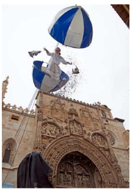
Bajada del Angel, Aranda de Duero, Burgos